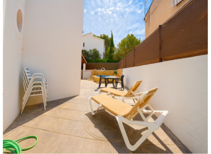
Sunbathing areas by the pool