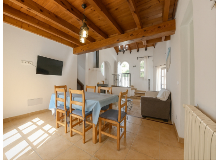
Dining area and living room view