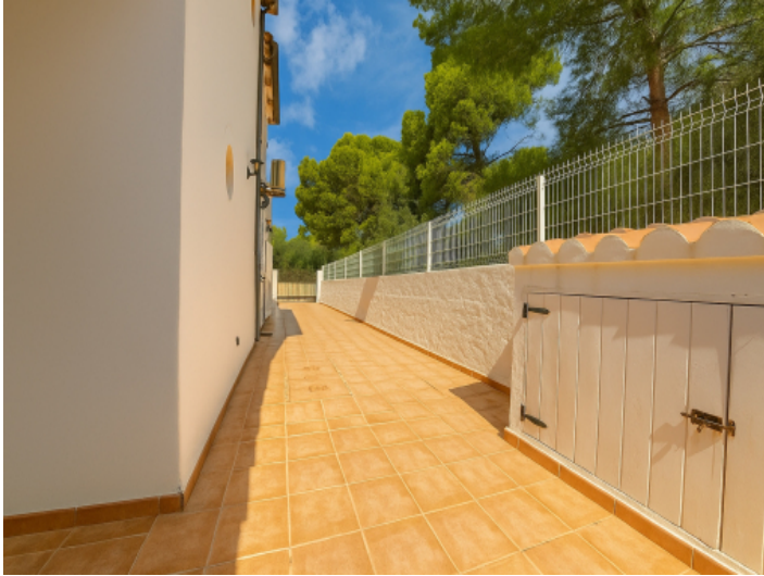
View of the driveway