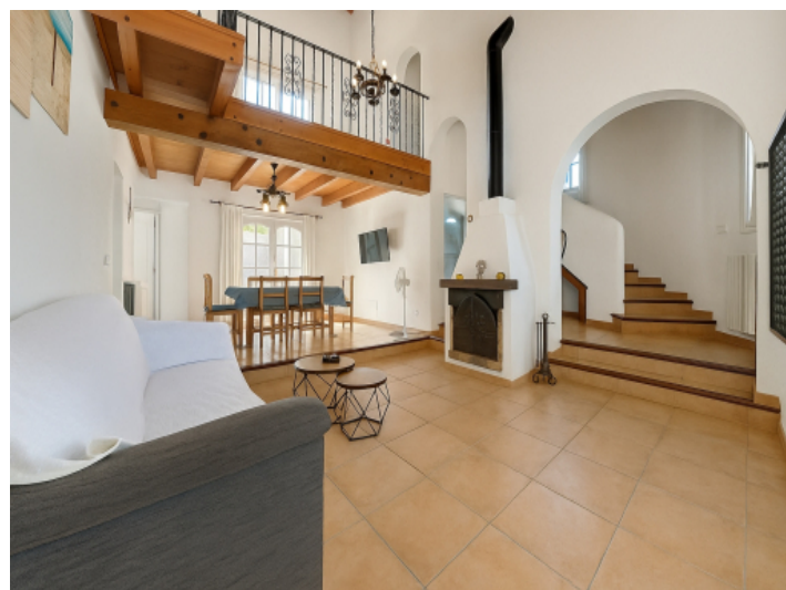
Living area with cozy fireplace