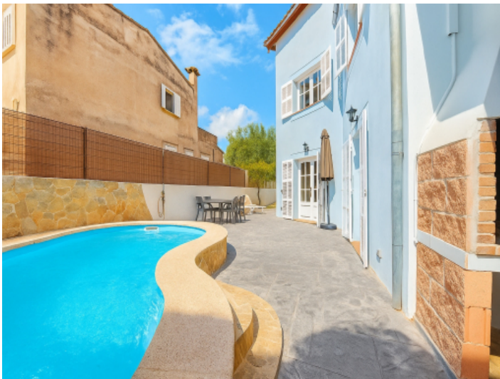
Pool at the rear side