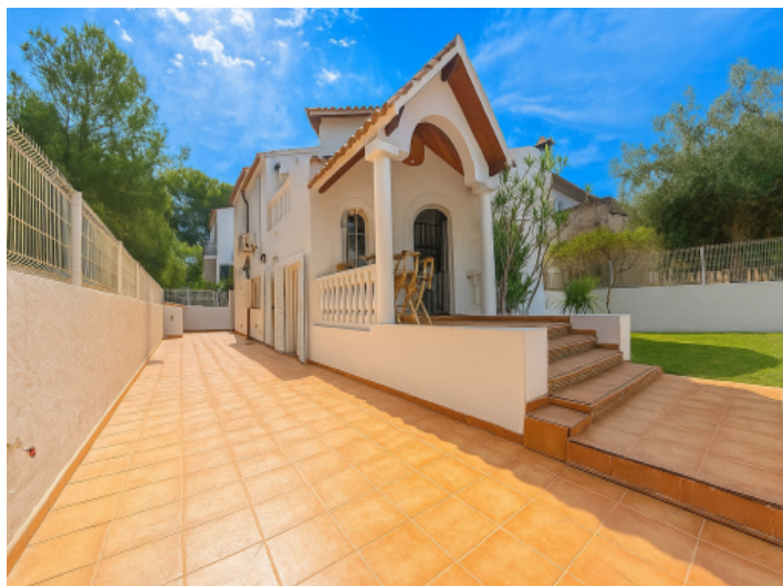
Driveway and main entrance view