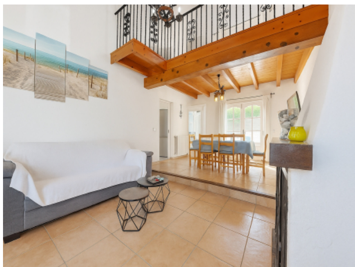
Living-dining area with gallery