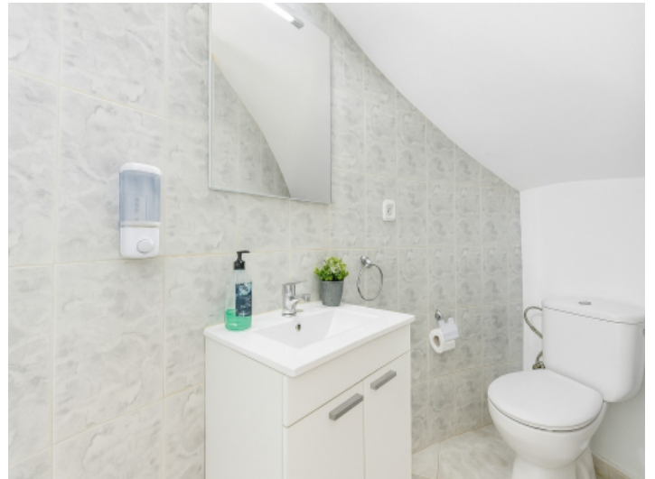
Guest WC on ground floor