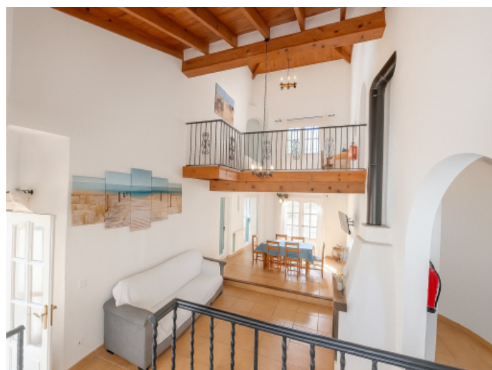
Living area seen from entrance