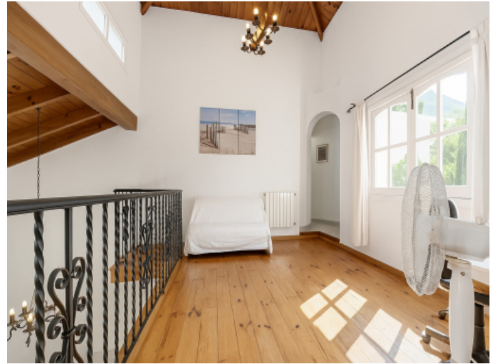
Bright open gallery