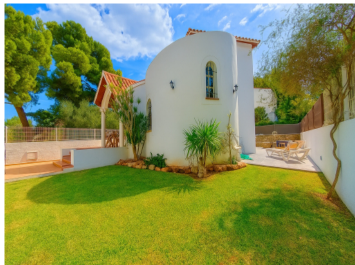
Garden view towards the house