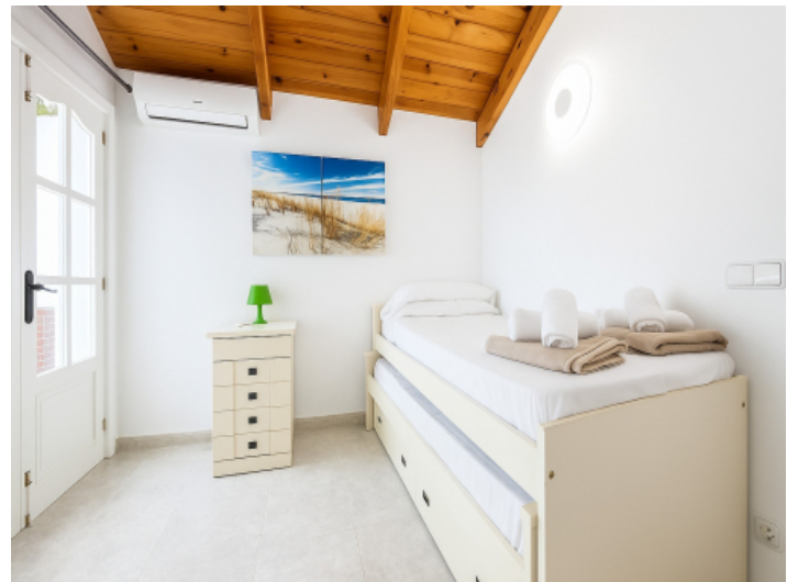
First upstairs bedroom of two