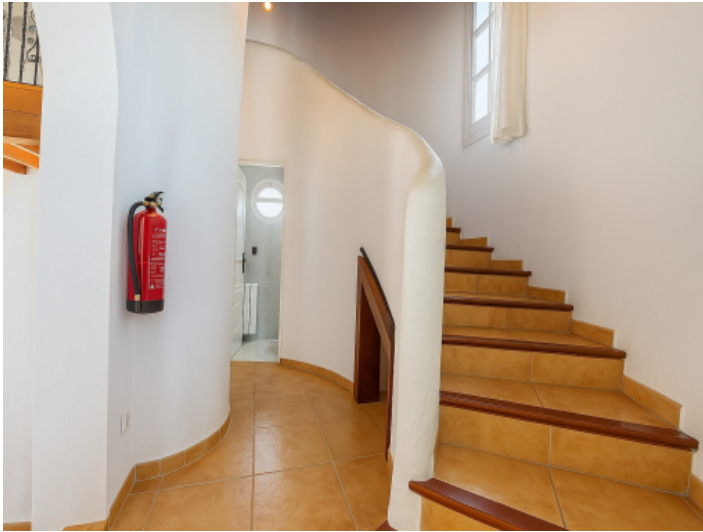
Staircase to upper floor