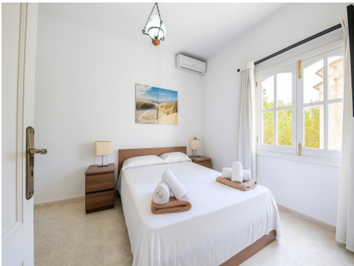
One of two bedrooms on the upper floor