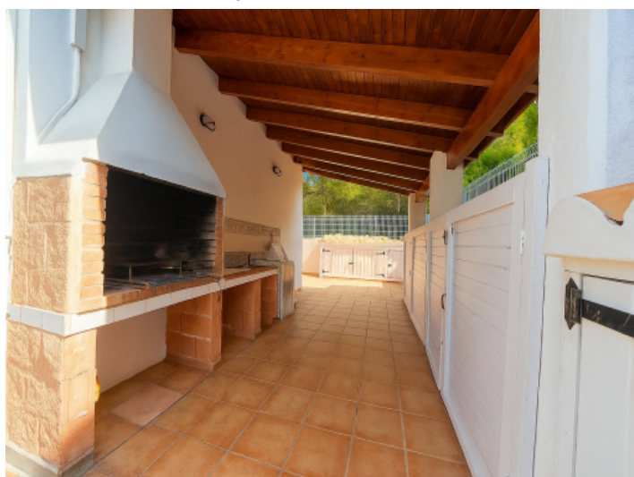
Covered BBQ area with storage