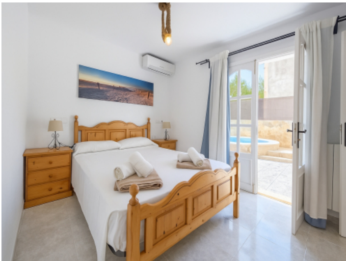
Master bedroom with pool access