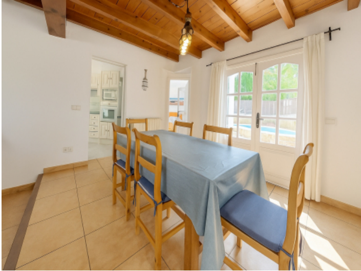
Dining area with garden access