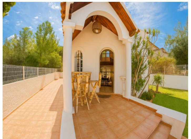
Entrance area with terrace