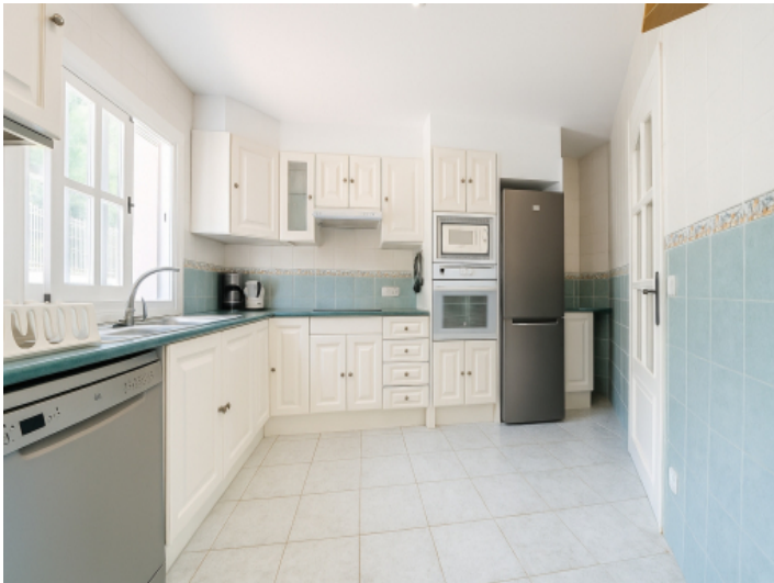
Fully equipped fitted kitchen