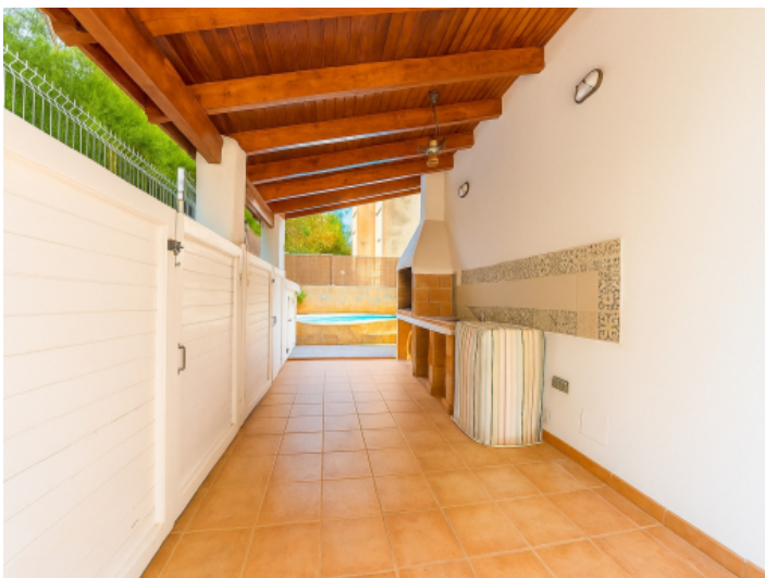
BBQ area in the garden