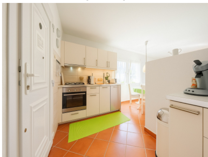
Entrance with kitchen