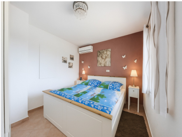
First double bedroom upstairs