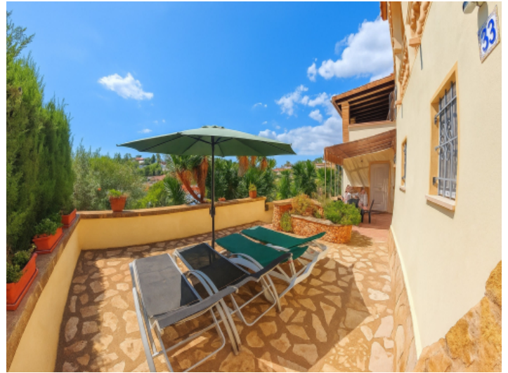
Sun terrace with wide panoramic view