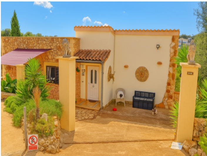
Rear facade with main entrance