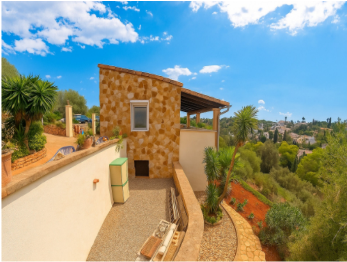
Side view with terrace in sight