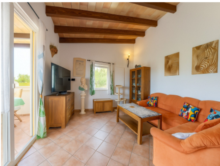
Living area with access to terrace