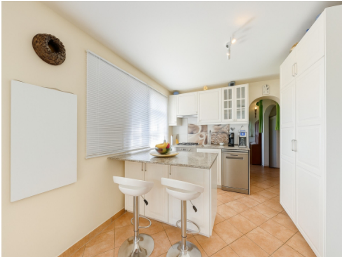
Fully equipped fitted kitchen