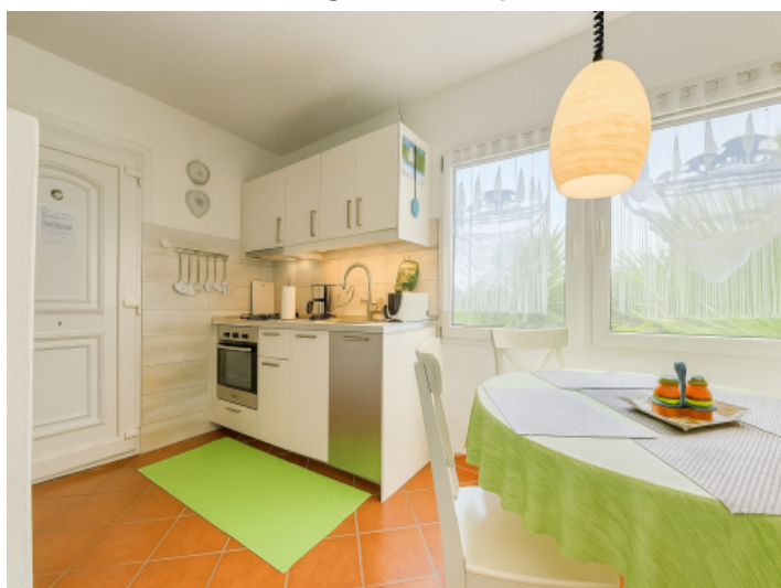
Dining area with kitchen