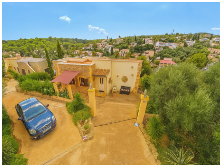
Second plot used as garden