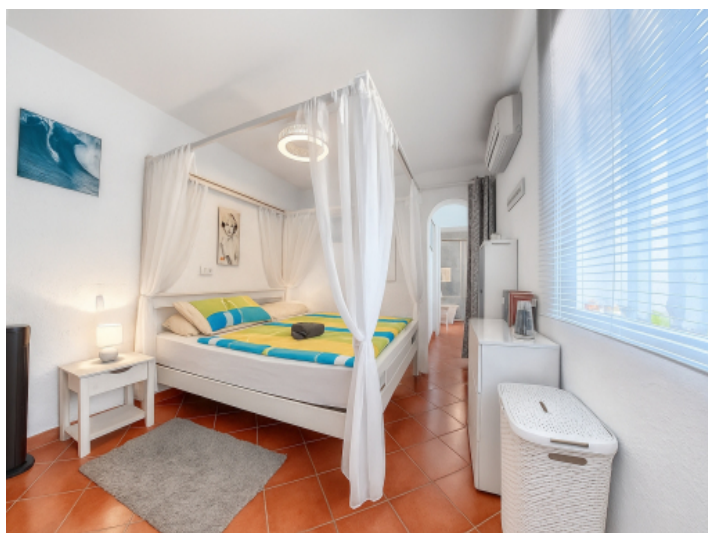
Double bedroom on ground floor