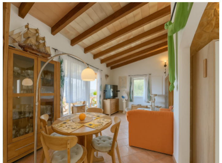
Kitchen view into dining and living room