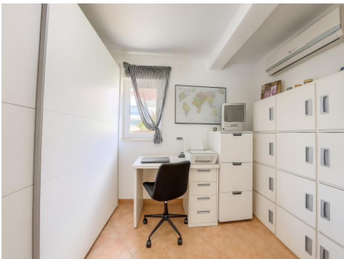
Second bedroom upstairs