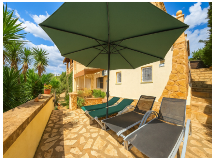
Terrace and entrance of ground floor apartment