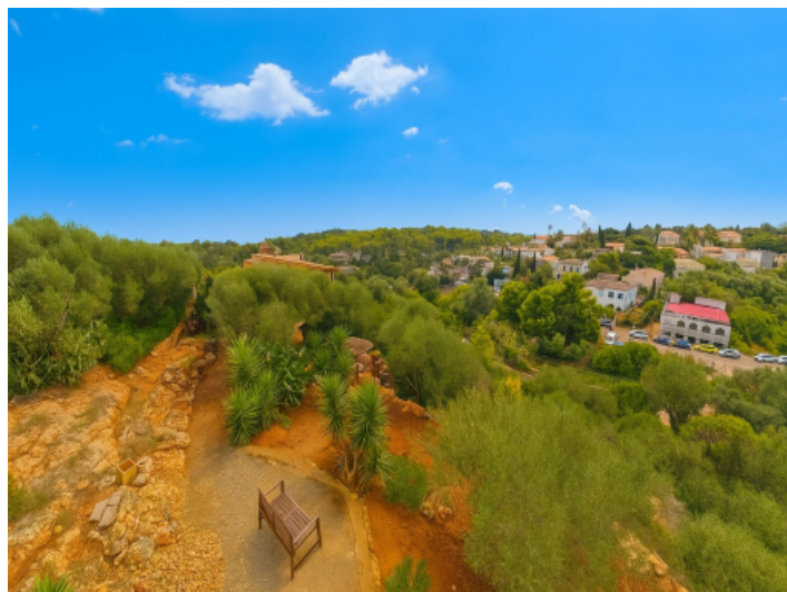
Panoramic view over urbanisation from second plot