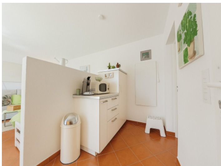
Entrance of ground floor apartment