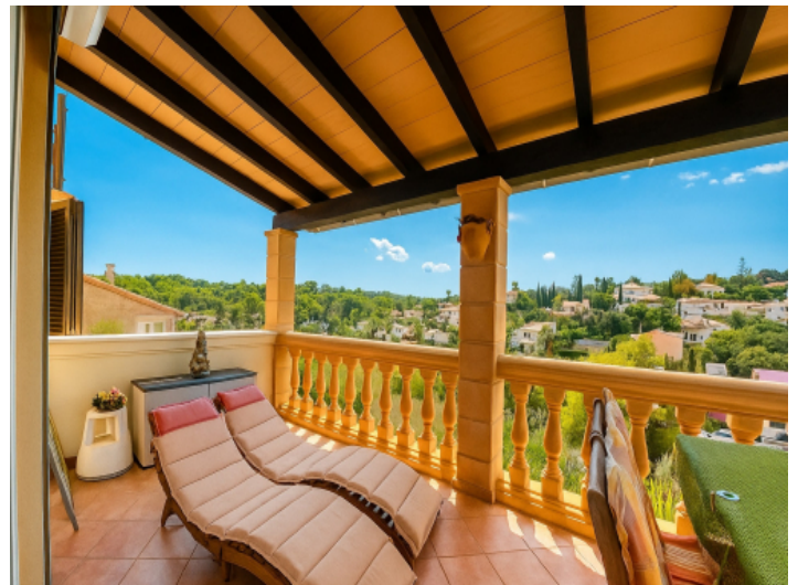
Covered terrace with dining area upstairs