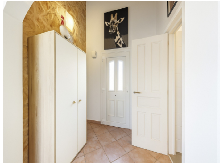
Entrance area upstairs