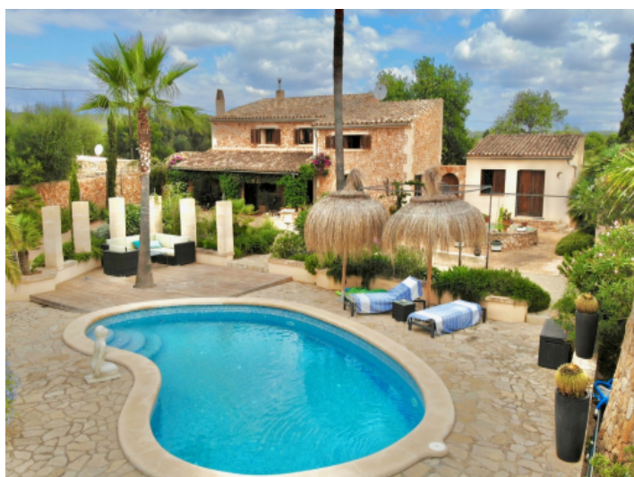
View from Pool