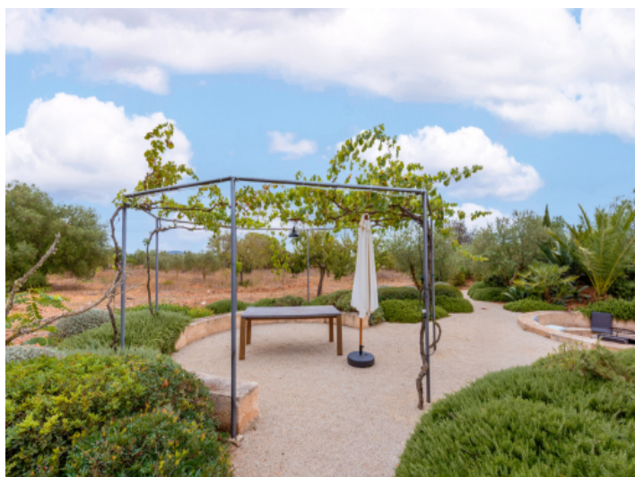
outdoor sitting area