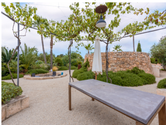
outdoor sitting area