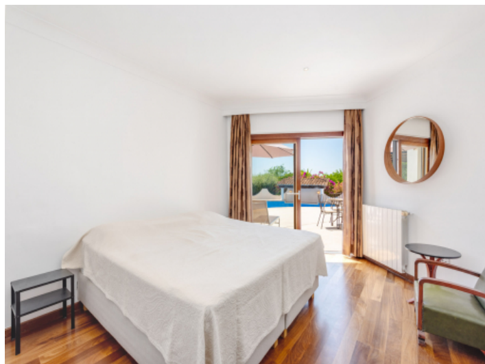
One of three bedrooms on the main floor