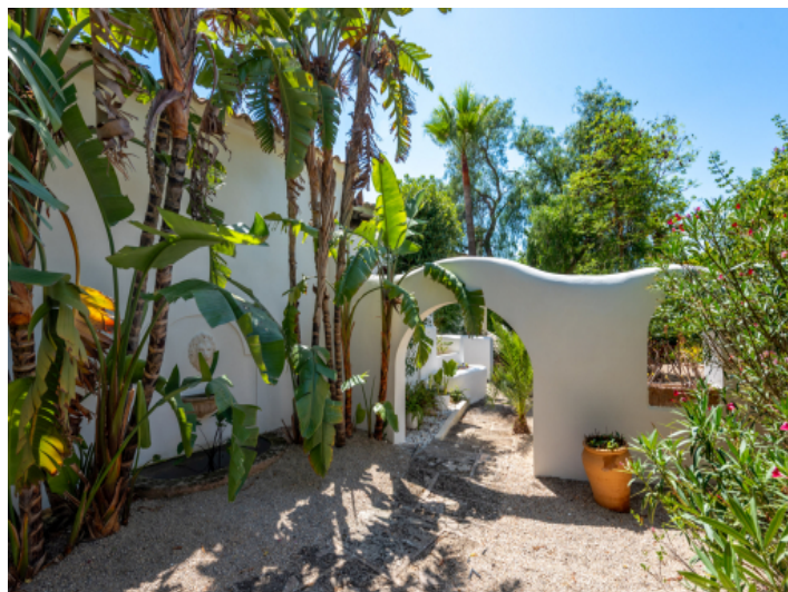
Mature, landscaped garden