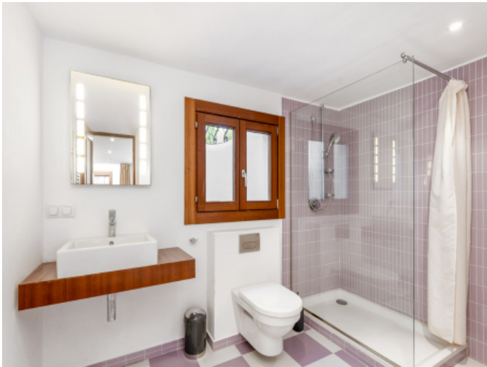
En-suite bathroom in the guest apartment