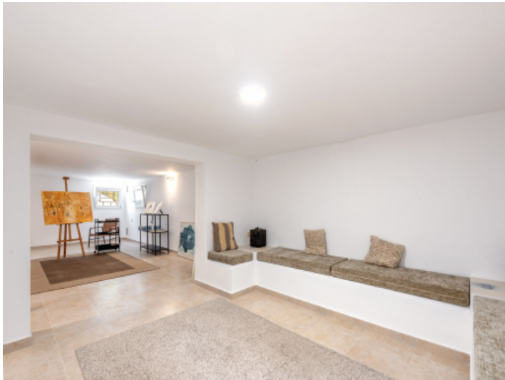
TV room on the lower level