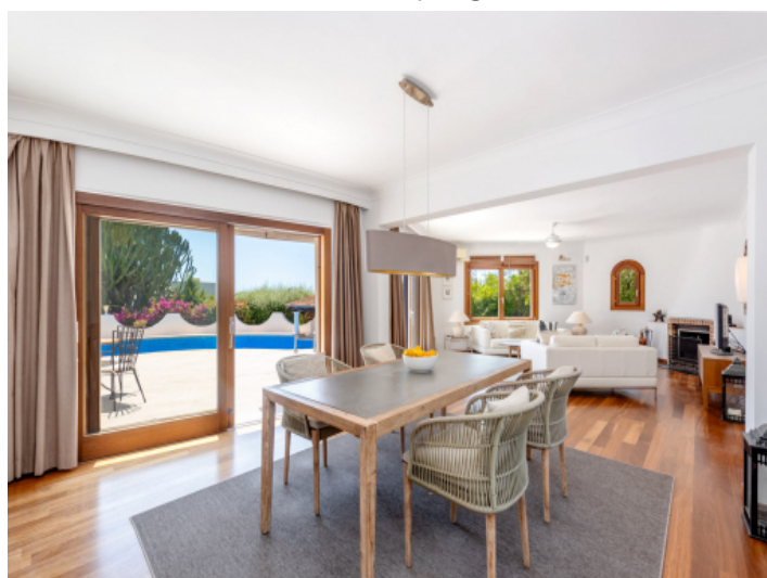
Bright dining area with fireplace