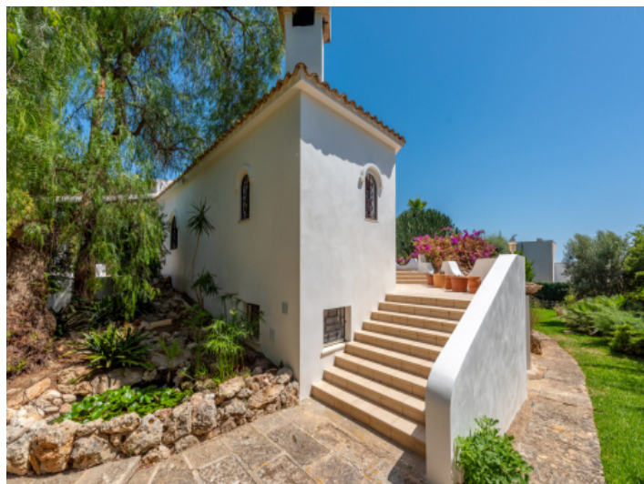
Rear side of the house with staircase leading to the pool