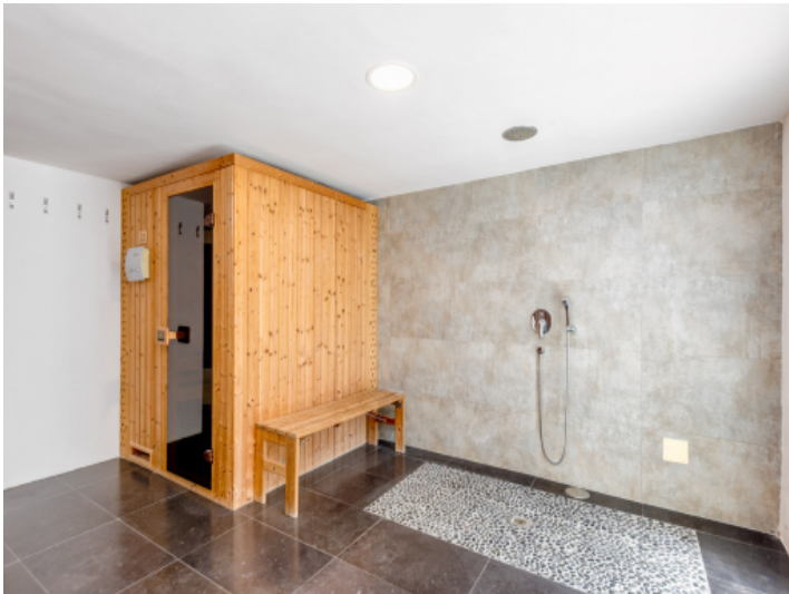
Sauna and shower on the lower level