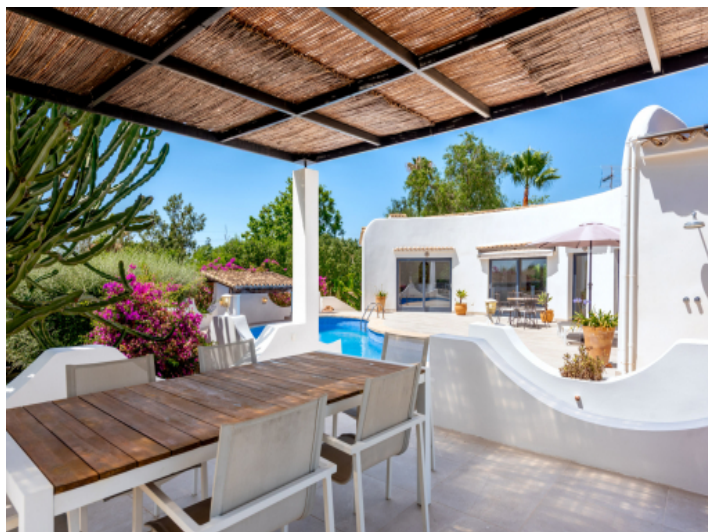
Covered seating area on the terrace