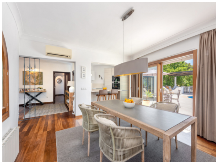
Open-plan living and dining area