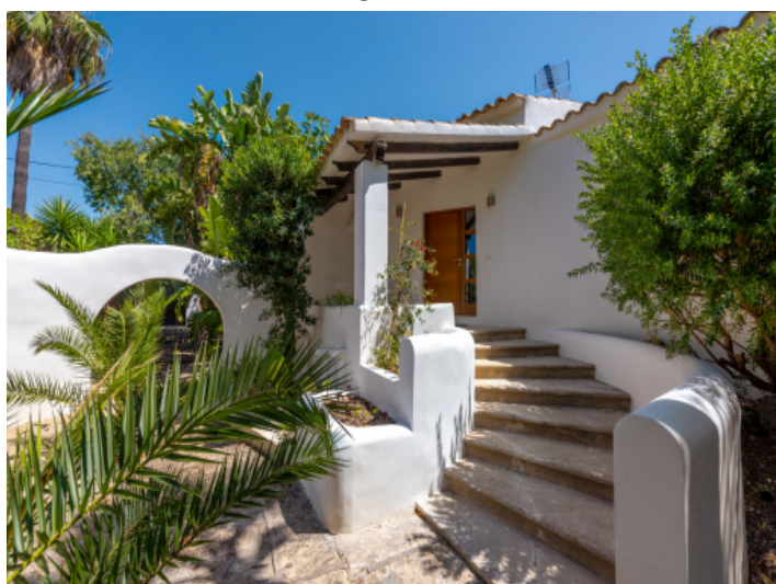
Main entrance to the villa