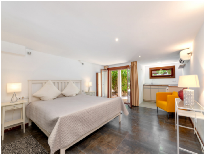
Guest apartment with kitchenette