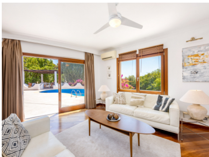
Bright living area with access to the pool terrace