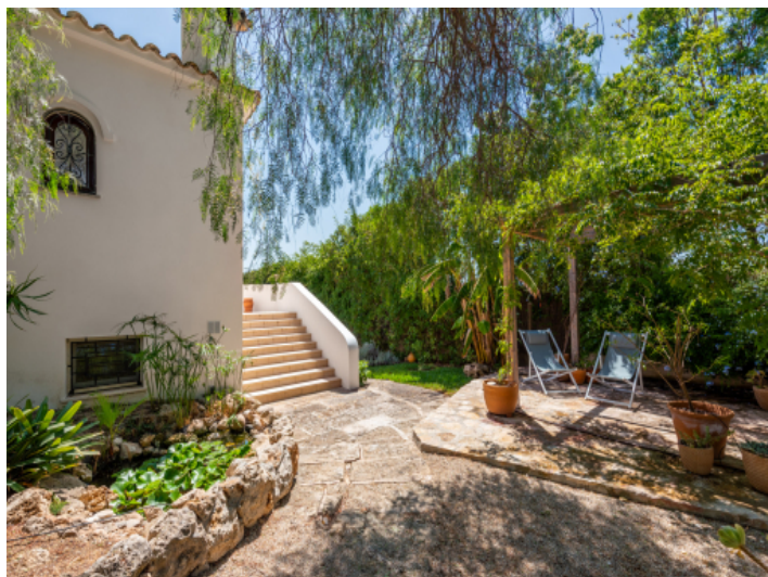
Garden pond with water lilies and cozy seating area