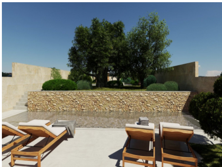
Newly-built townhouse with pool