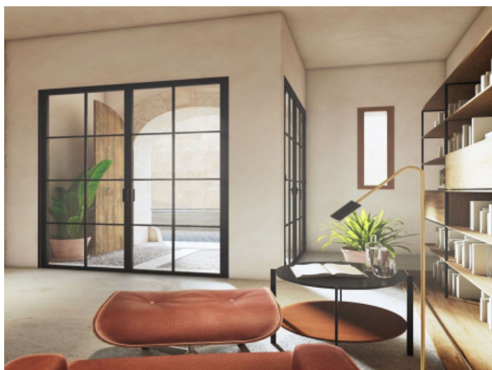
Elegante entrance area