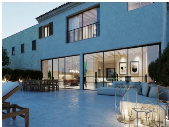
House at night