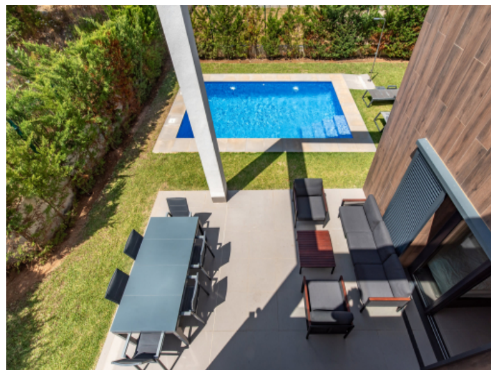
View from the balcony to the pool