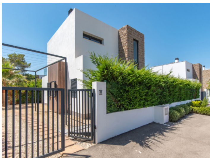
Entrance to the house