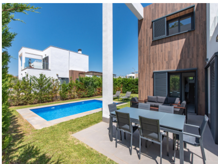
Terrace with pool