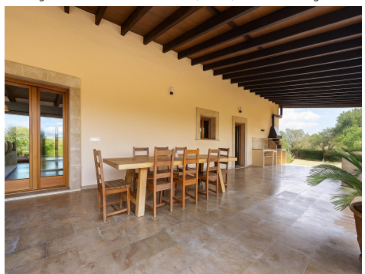
Barbecue terrace with outdoor kitchen and countryside view