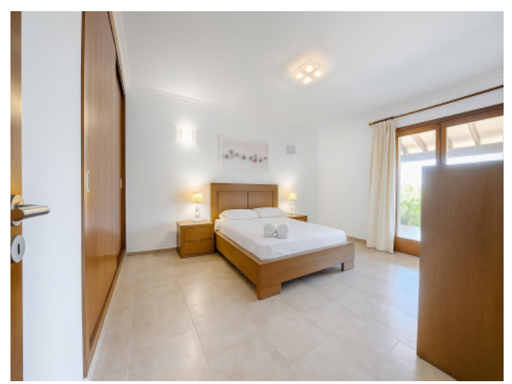
Second bedroom with built-in wardrobes and access to the