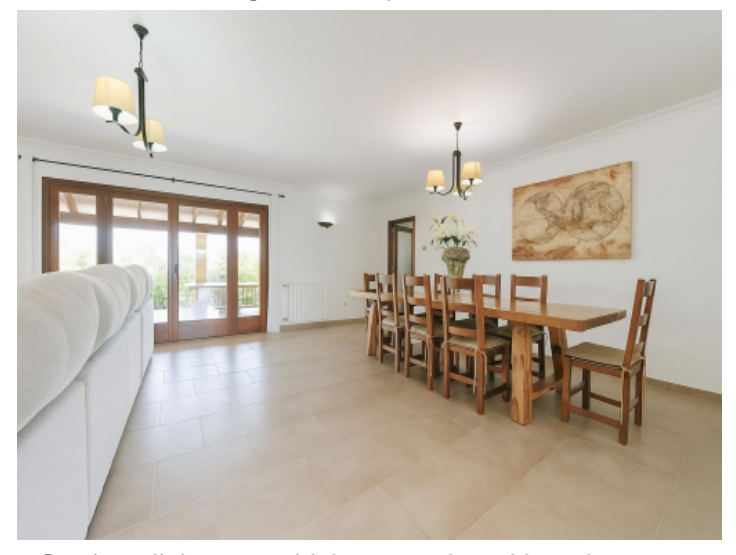
Spacious dining area with large wooden table and access to