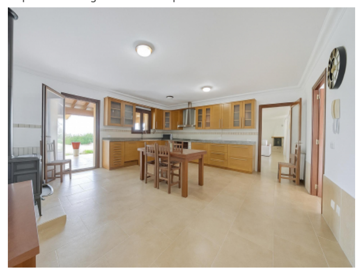
High-quality country-style kitchen with solid wood fronts and