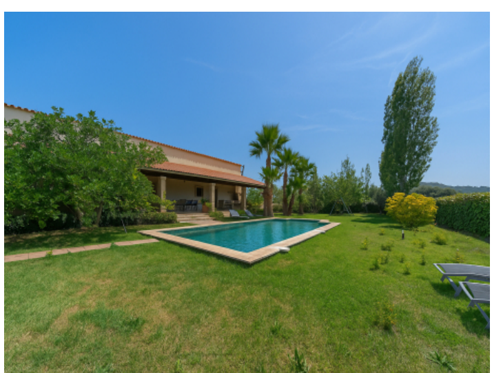
Mediterranean garden with pool and covered terrace