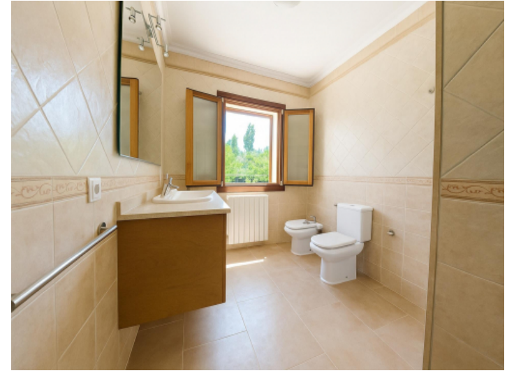
Modern guest bathroom with bidet and window - comfortable