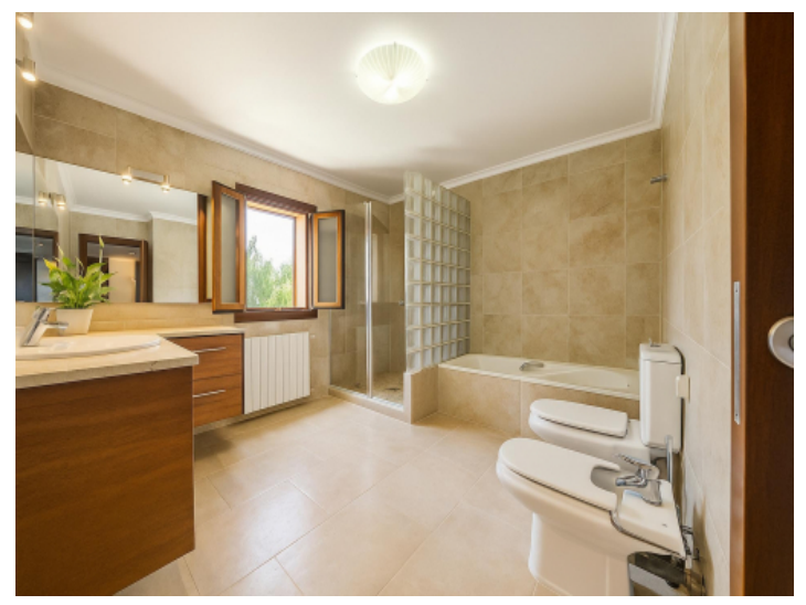
Elegant bathroom with bathtub, bidet, and natural light in