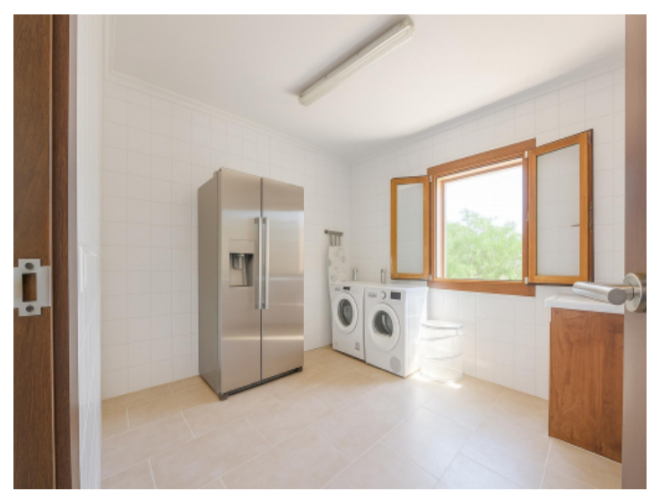
Utility room with washing machine, dryer and large