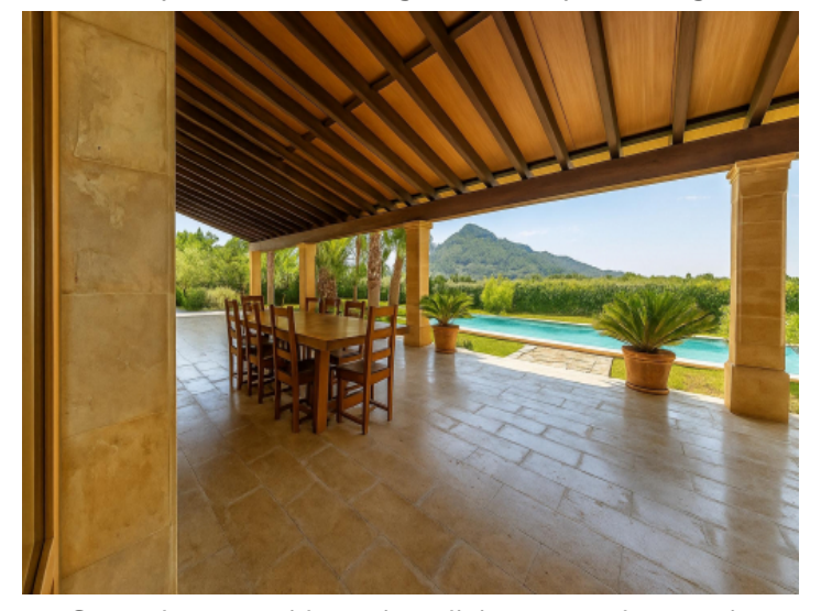
Covered terrace with spacious dining area and mountain