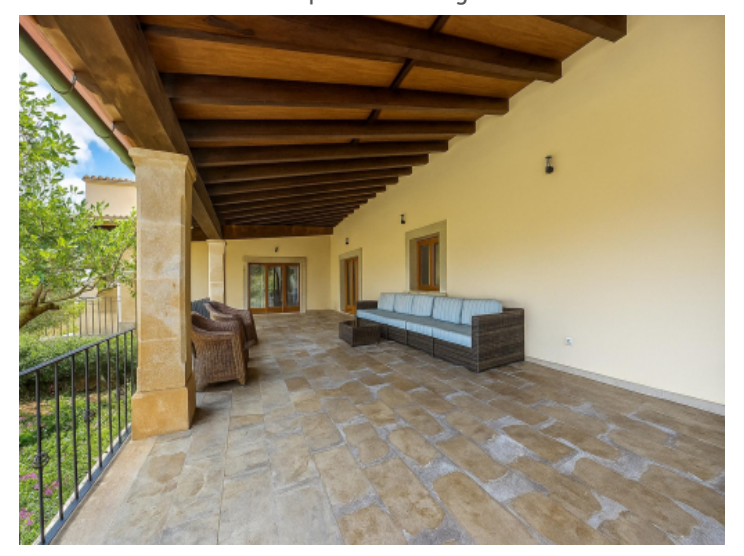
Upper balcony with lounge furniture and garden view