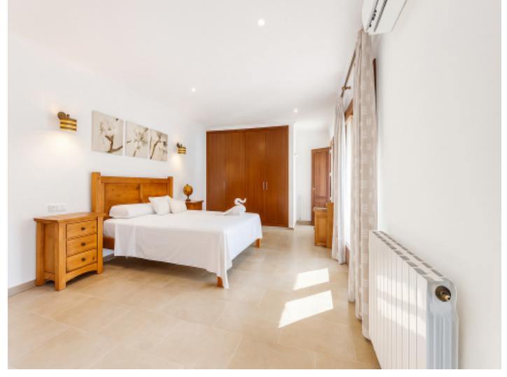
Bright master bedroom with large built-in wardrobe and air