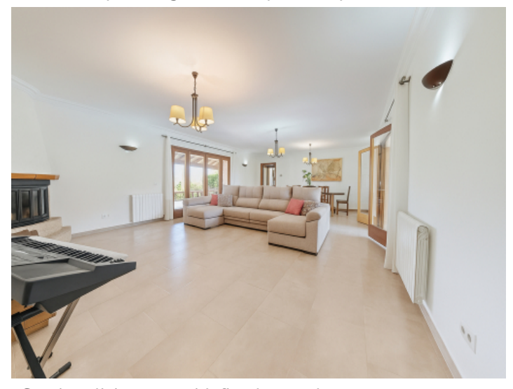
Spacious living area with fireplace and access to two terraces