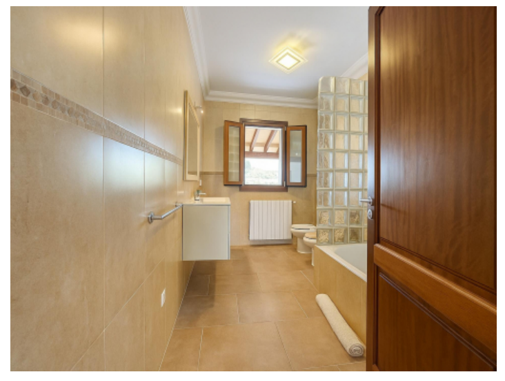
Spacious bathroom with bathtub, natural light, and stylish