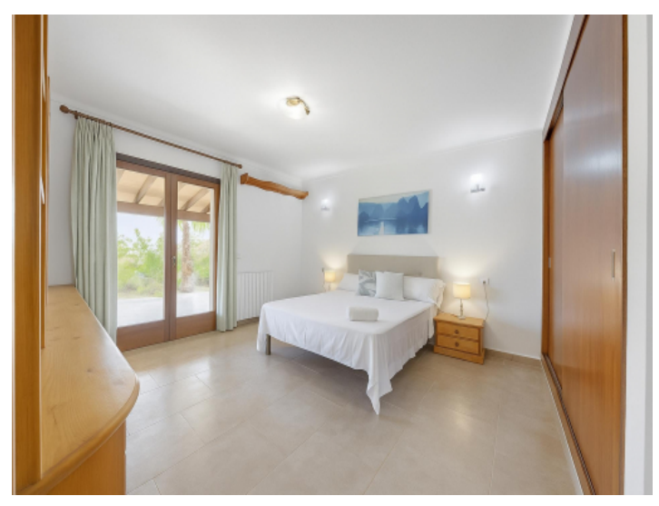
Bright and elegant double bedroom with direct access to the