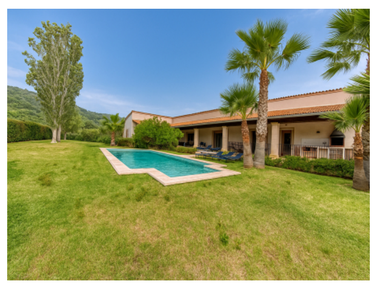
Spacious garden with pool and palm trees