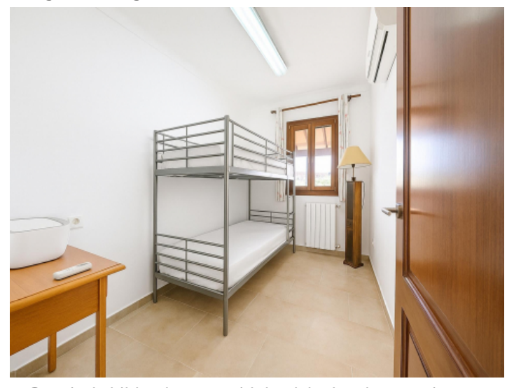
Practical children's room with bunk bed and green views -