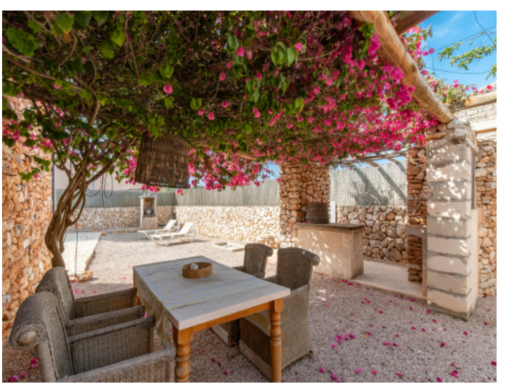
Patio with outdoor kitchen