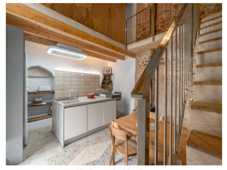
Kitchen unit side view