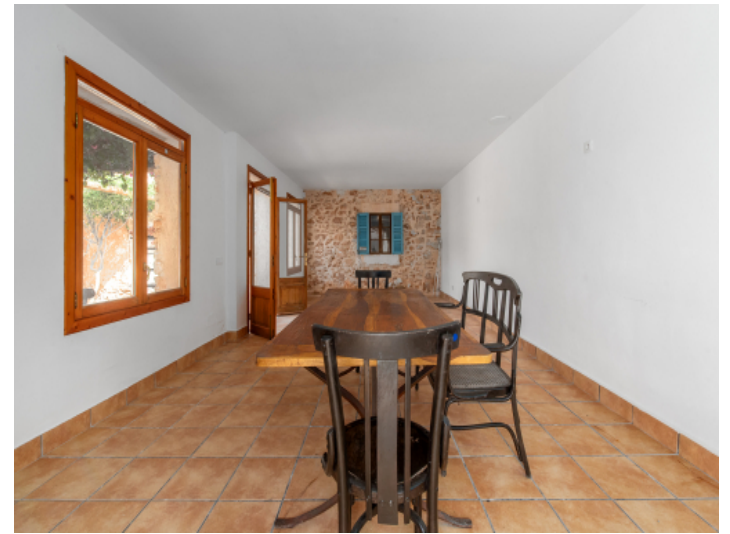
Side extension with living area