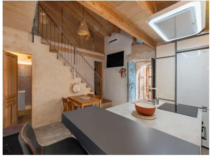
Fitted kitchen front view