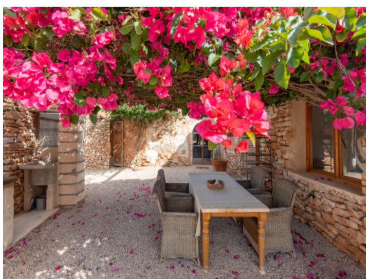
Patio with bougainvillea