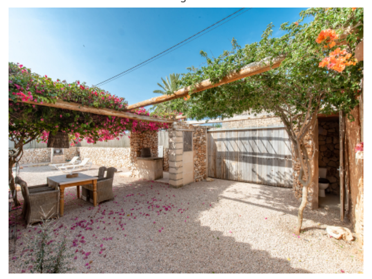
Patio entrance area