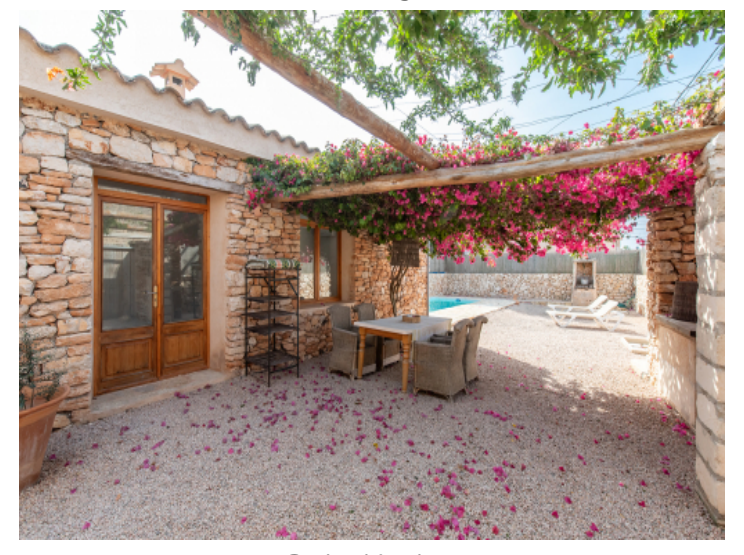
Patio side view