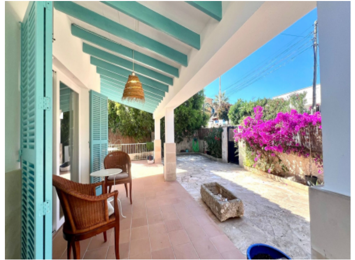
Covered terrace in the front