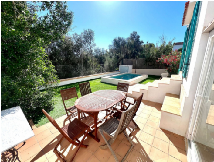
Terrace at the pool