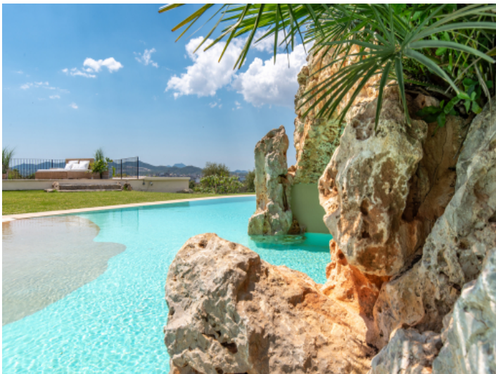
Pool with grotto