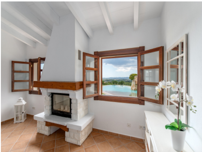
Dining area with chimney and views