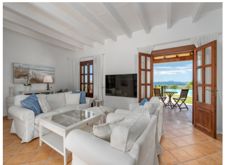
Living area with views