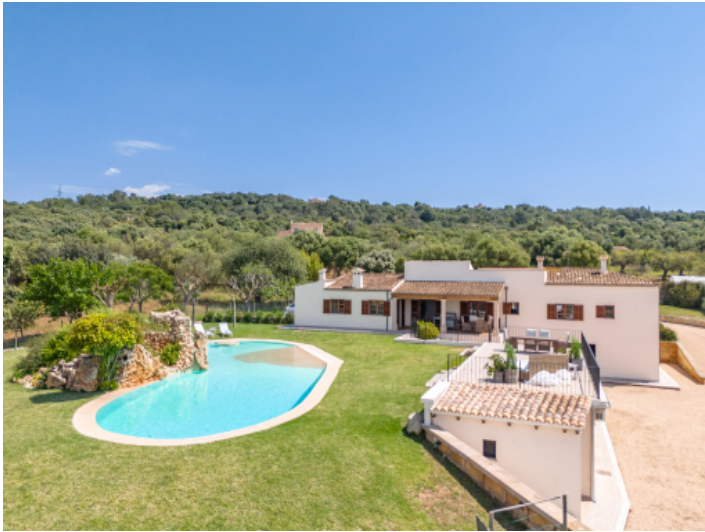
South west orientation