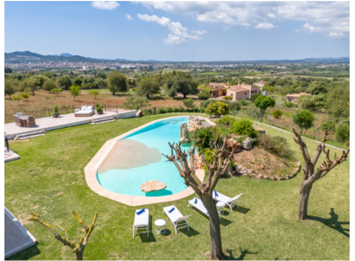
Pool with views