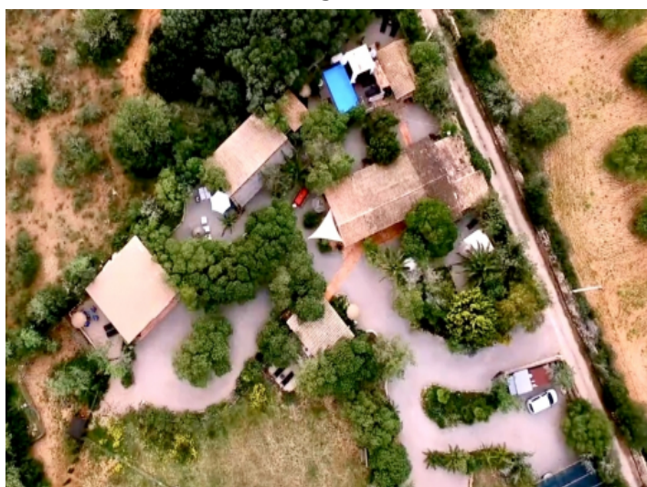
from the Sky