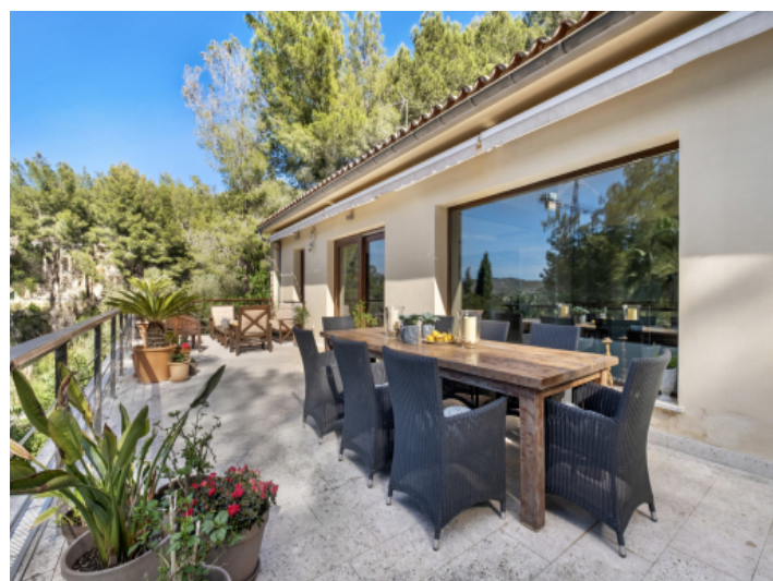
Outdoor dining area