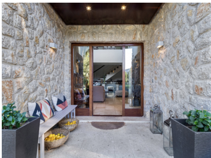
Impressive entrance area