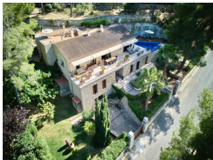
Exterior view of the villa