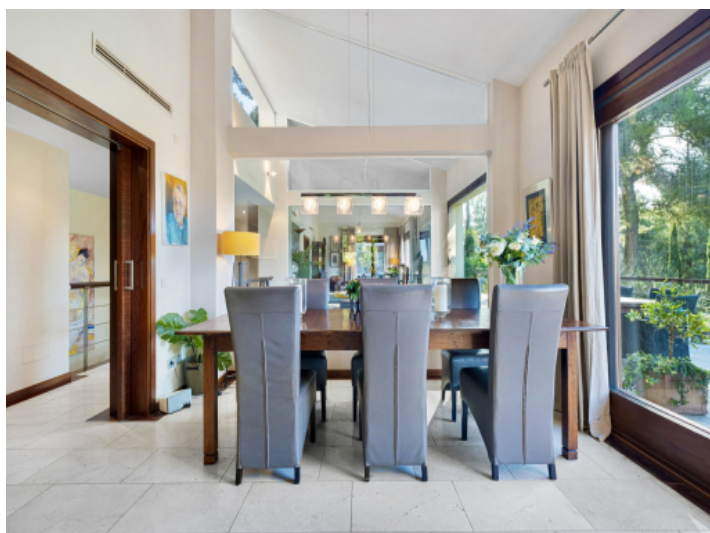
Bright, open dining area