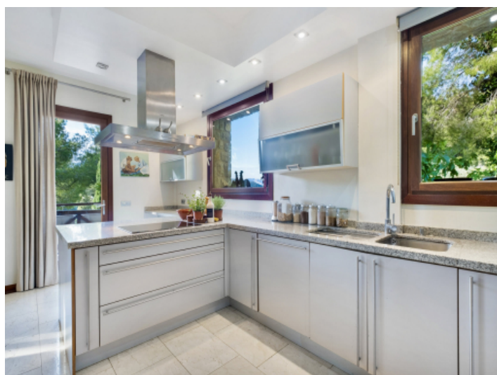
Spacious built-in kitchen