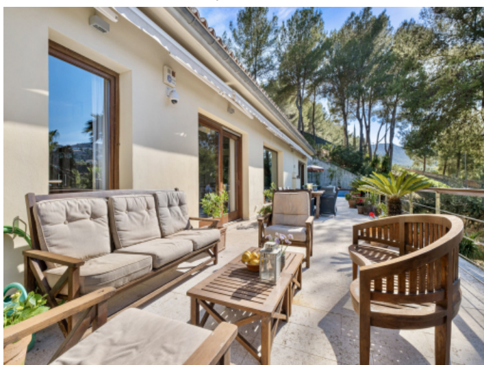
Sunny outdoor terrace