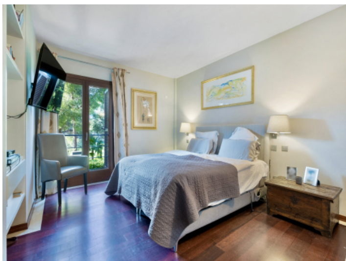
One of 5 spacious bedrooms