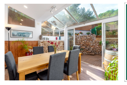
Portals Nous search for property MAL-122201