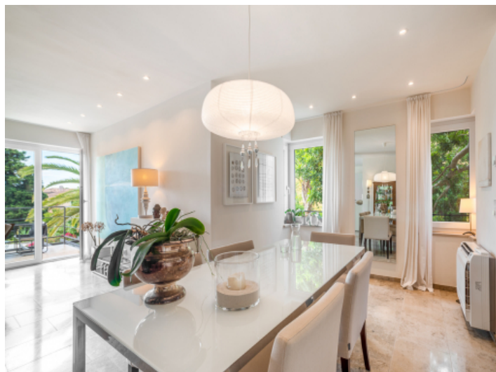
Adjoining dining area