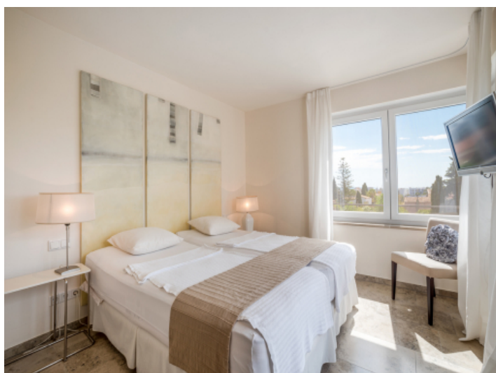
One of 6 bedrooms