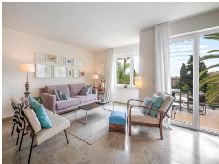
Open living area