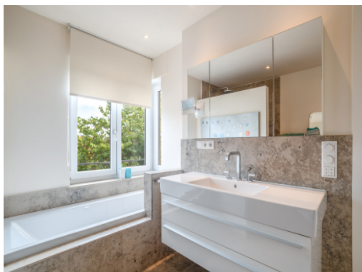
Modern bathroom with bathtub