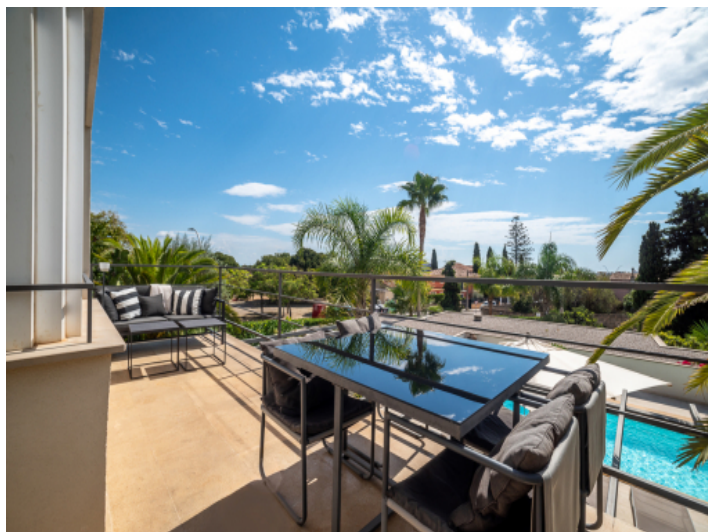
Balcony with a view