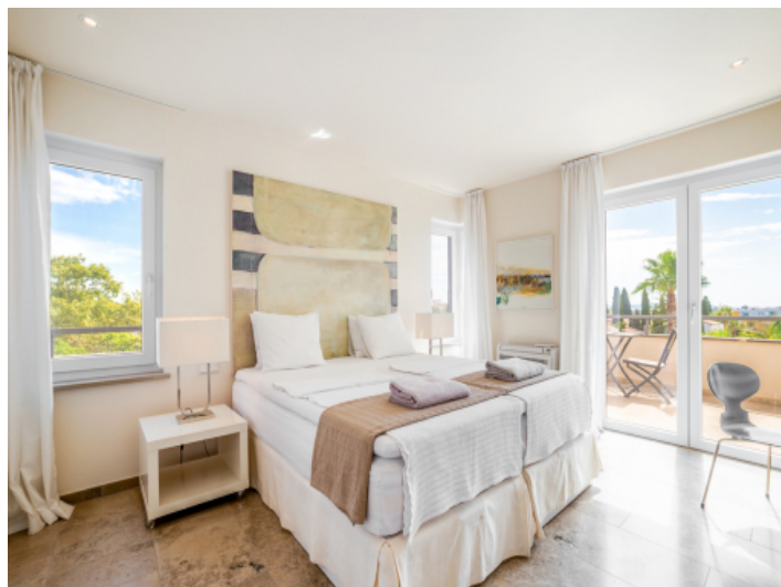
One of 6 bedrooms