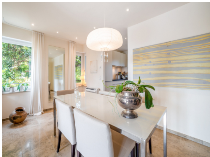
Dining area with kitchen access