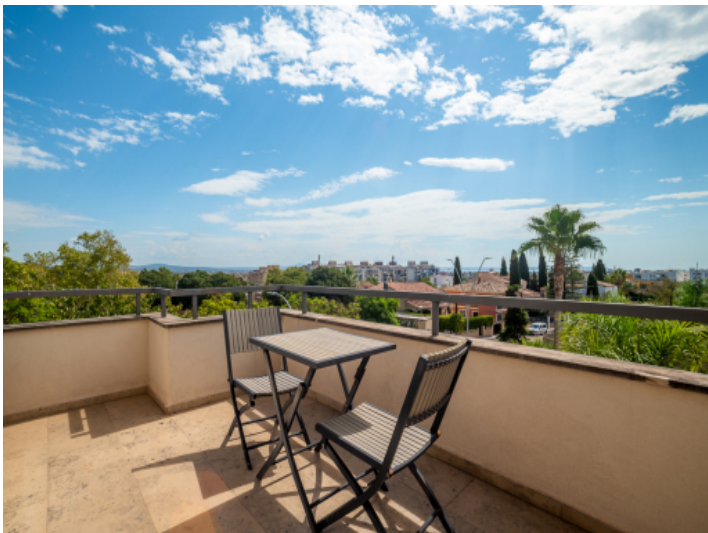
Upper terrace with sweeping views