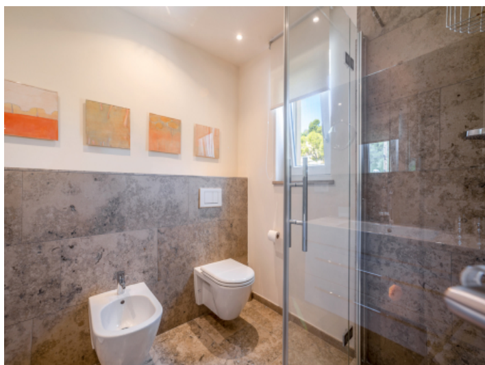
One of 5 bathrooms