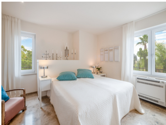
One of 6 bedrooms