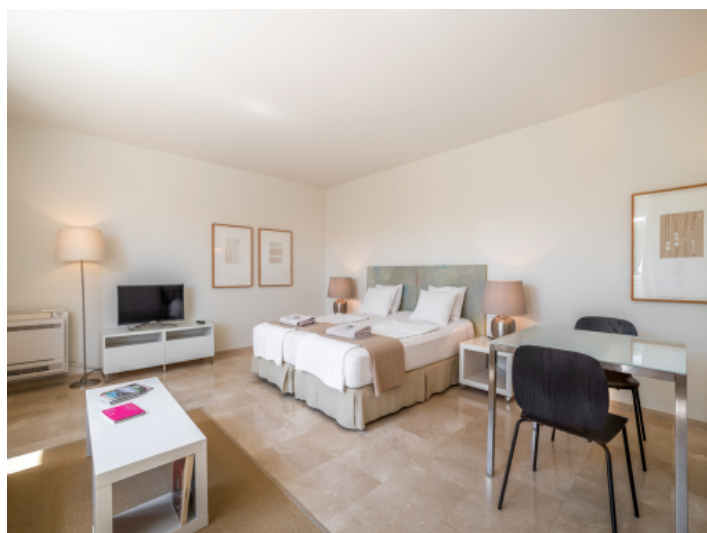
Spacious guest apartment