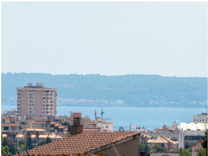
View as far as the sea