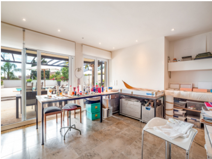
Working area / studio