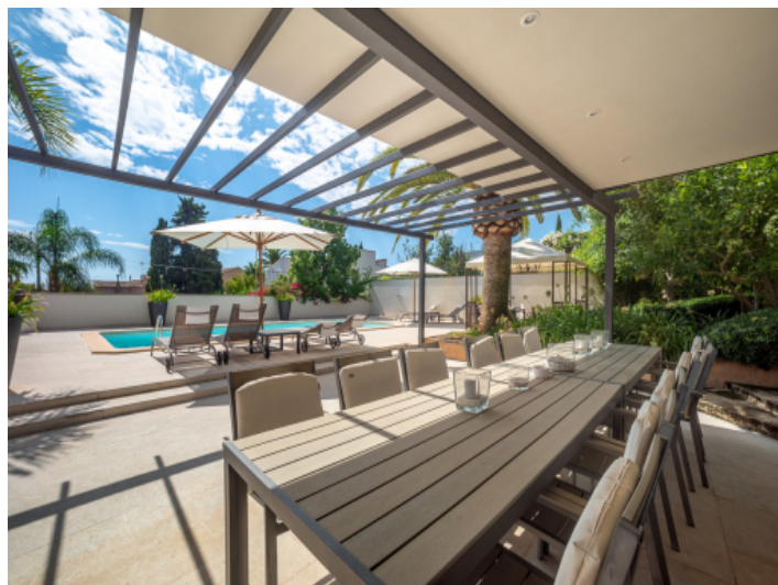
Covered dining area