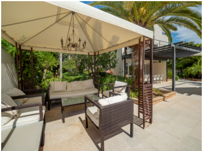
Chill out area on the terrace