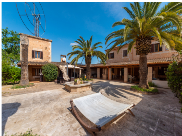
View of interior patio