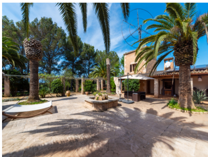
View of Innercourt