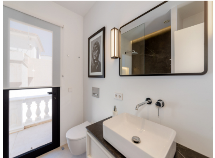
One of three bathrooms