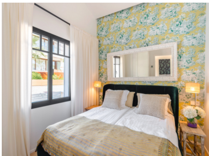
One of four bedrooms