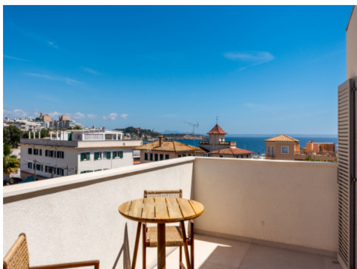
Terrace with sea view