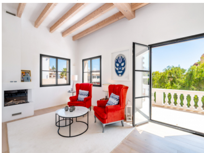
Lounge area with fireplace