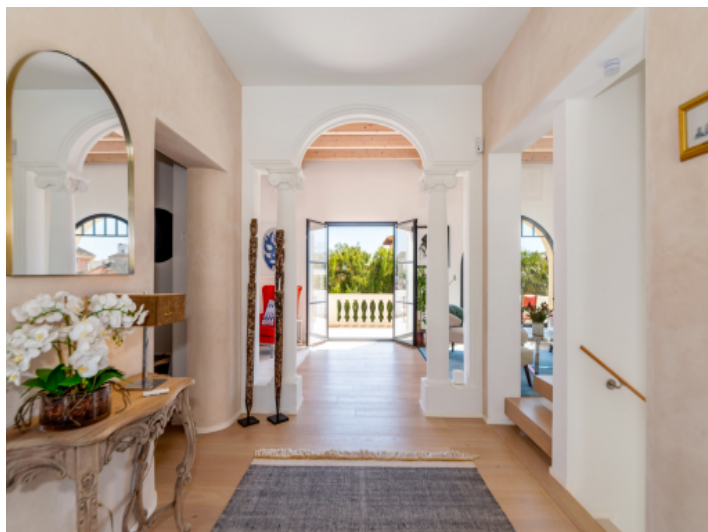
Stylish entrance area