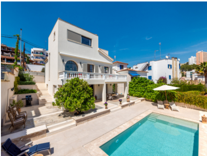
Overall view of the villa