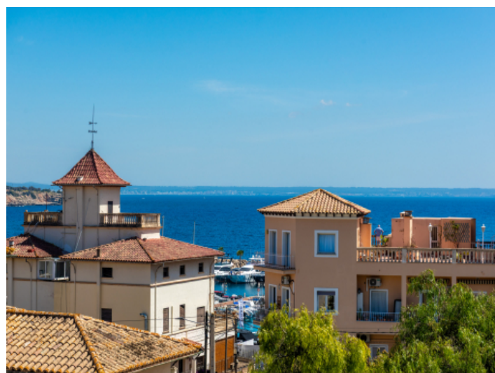
View of the harbor and the sea