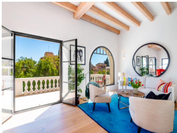
Living area with access to the terrace