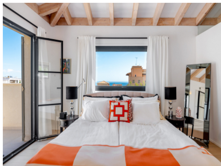
Master bedroom with a view