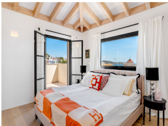
Master bedroom with terrace