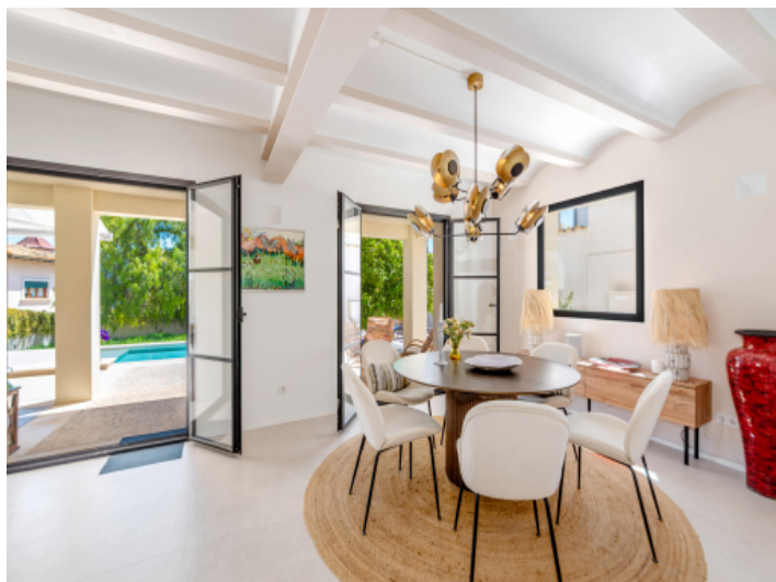
Open dining area