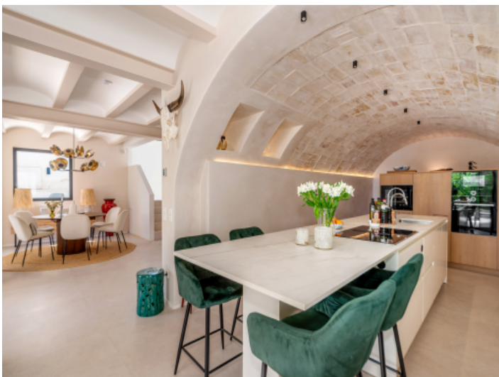
Kitchen with adjacent dining area