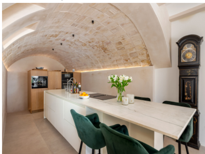
Kitchen with vaulted ceiling