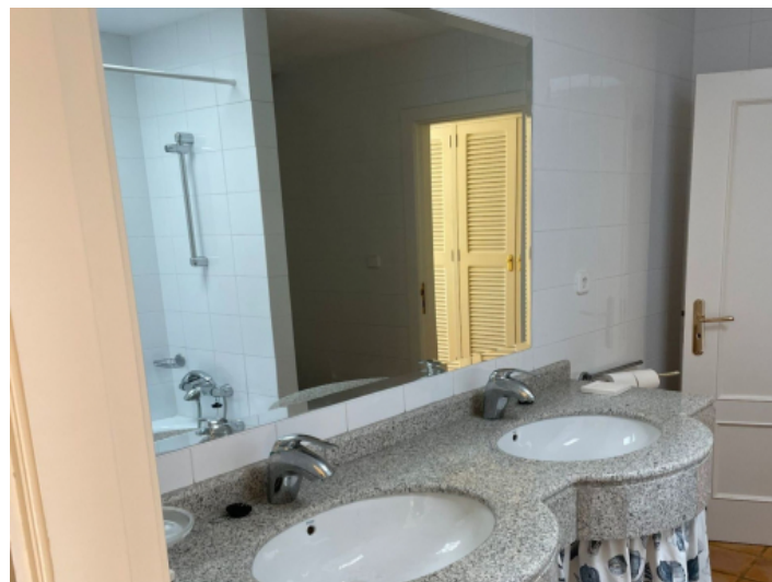
One of 8 bathrooms