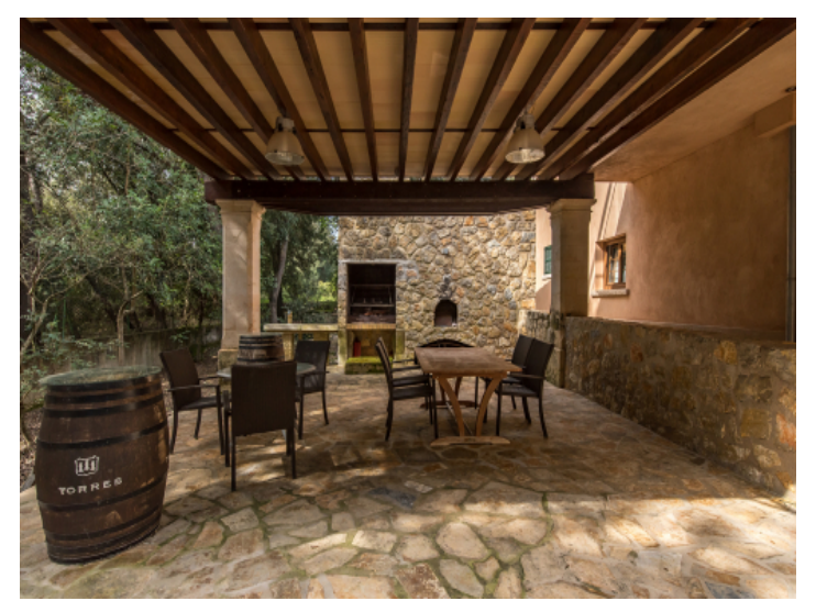
Outdoor dining area next to BBQ