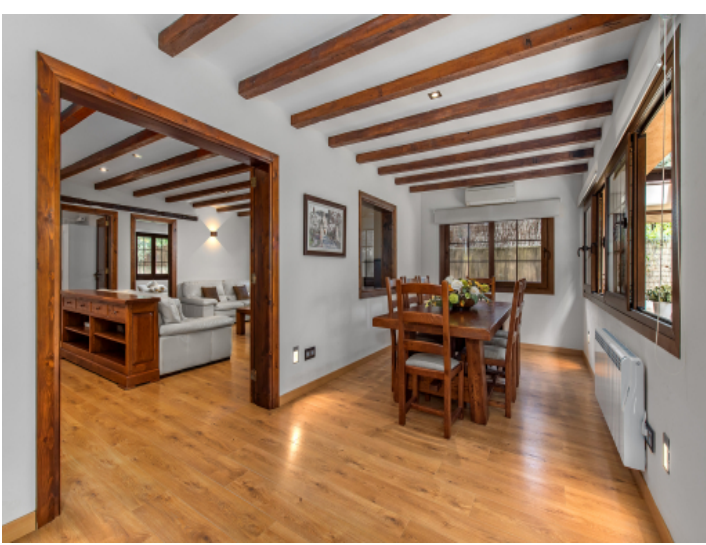
Living and dining area with plenty of daylight