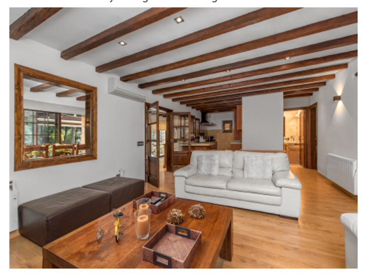
Living area with cozy sofa arrangement