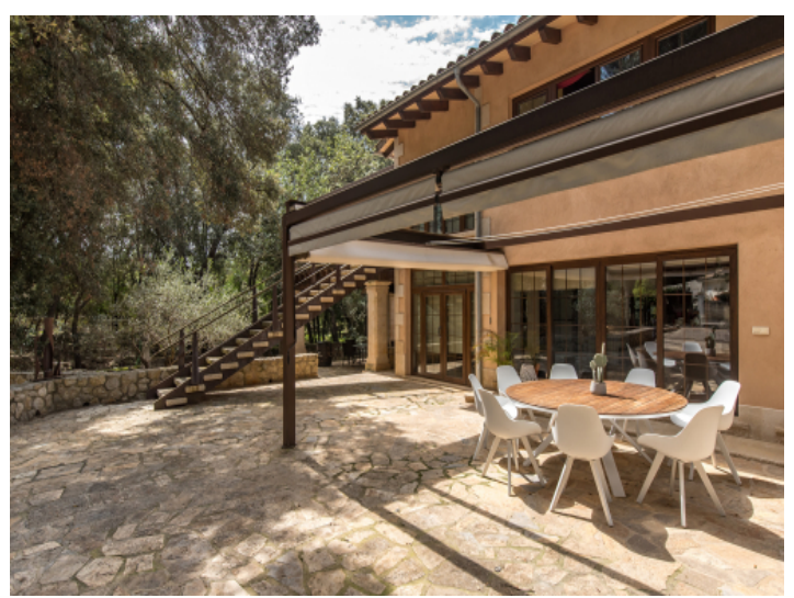
Spacious terrace with outdoor dining area