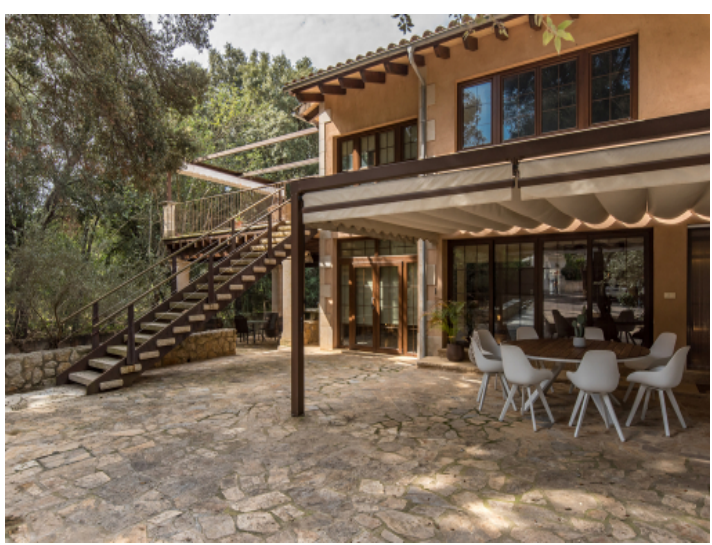
Exterior staircase to upper floor