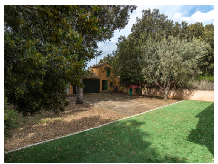
Access to garage through lush outdoor area