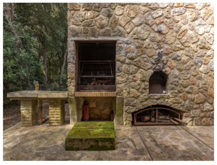
Traditional stone BBQ area