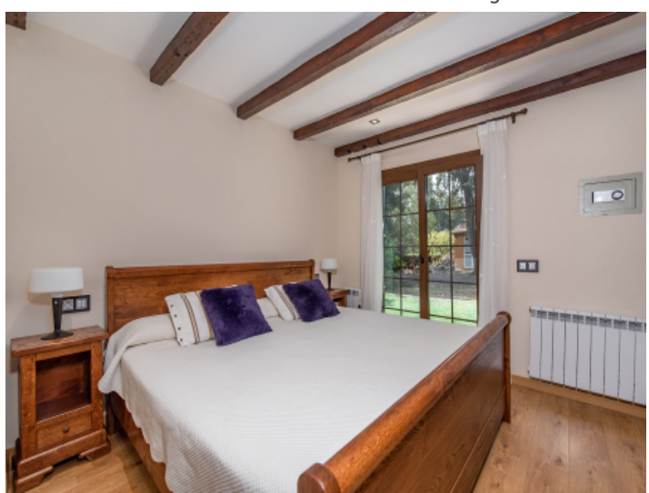
Third bedroom with natural light and wooden ceiling