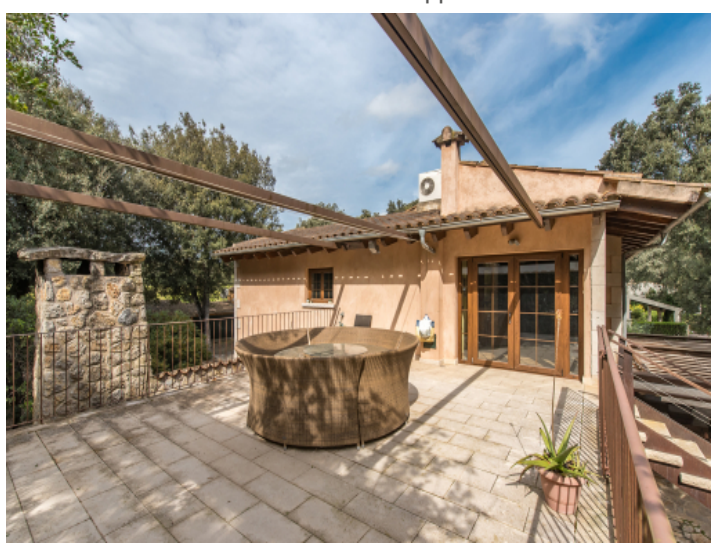
Upper floor terrace with view