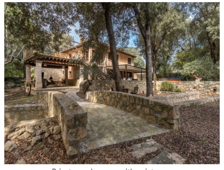
Private garden area with quiet zone