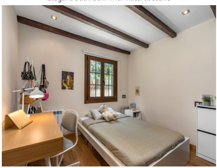
Cozy bedroom with wooden beams