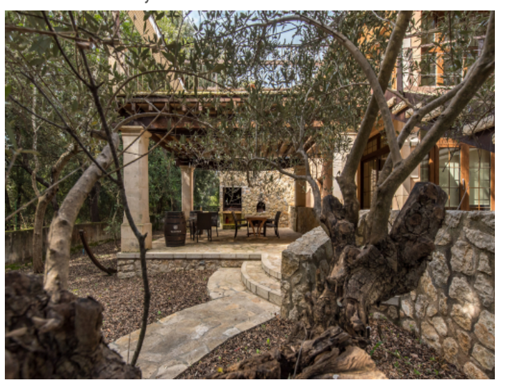
Covered terrace with garden view