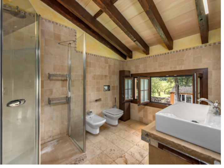
Second bathroom with natural stone and garden view