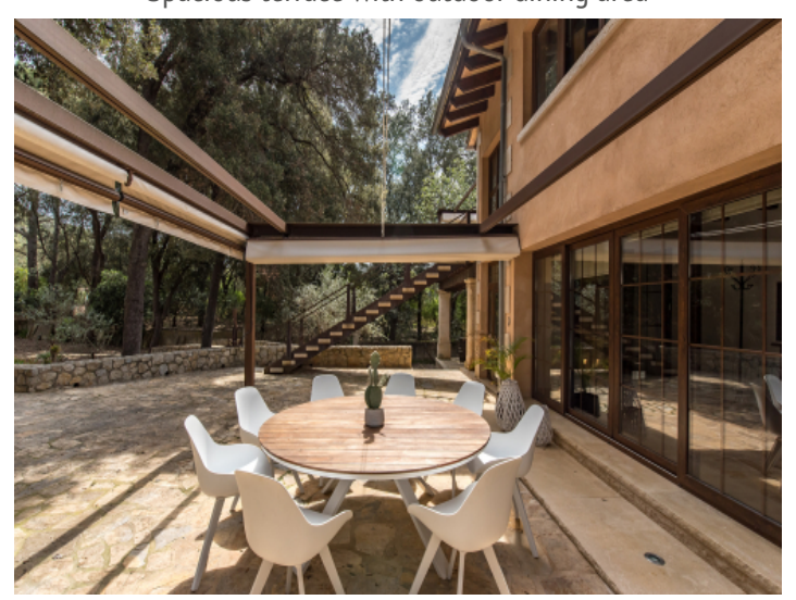
Sunny terrace in front of the main entrance