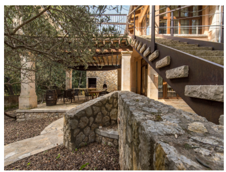
Entrance view of the chalet