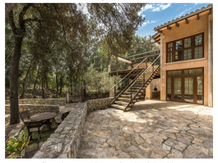
Charming natural stone façade of the villa