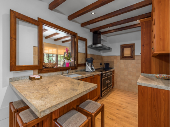
Separate kitchen with stone details