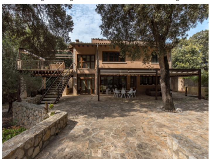
Front view of the chalet with driveway