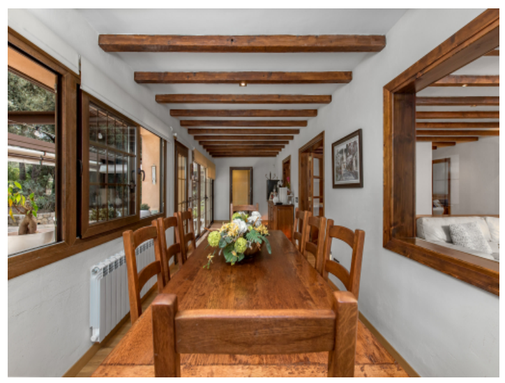
Bright dining room with wooden beam ceiling