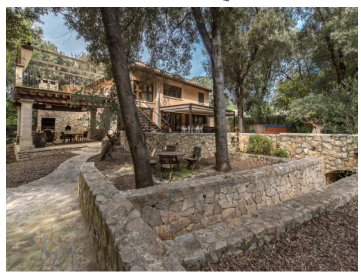
Rustic chalet with natural materials