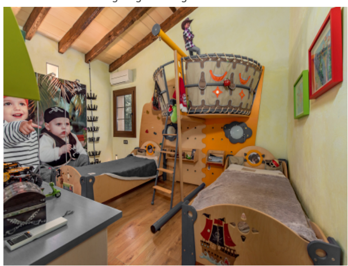
Fourth bedroom with individual charm