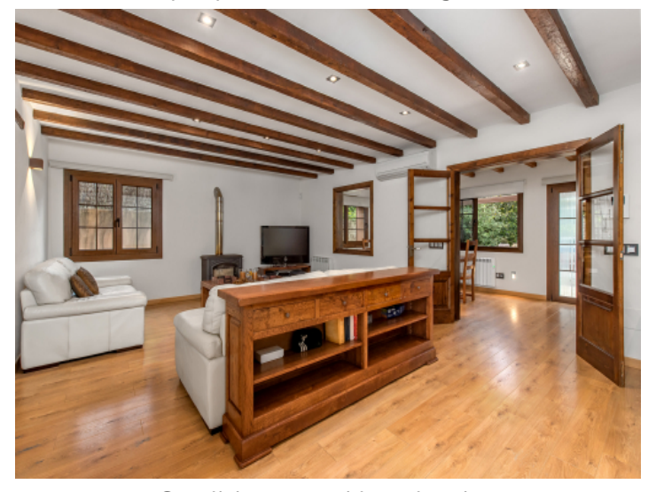
Cozy living room with garden view