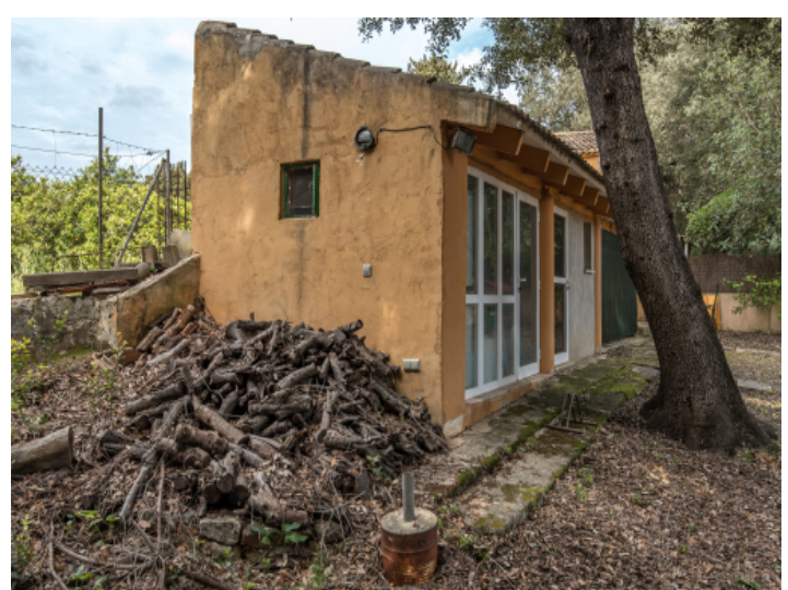
Side view of the chalet with surrounding trees