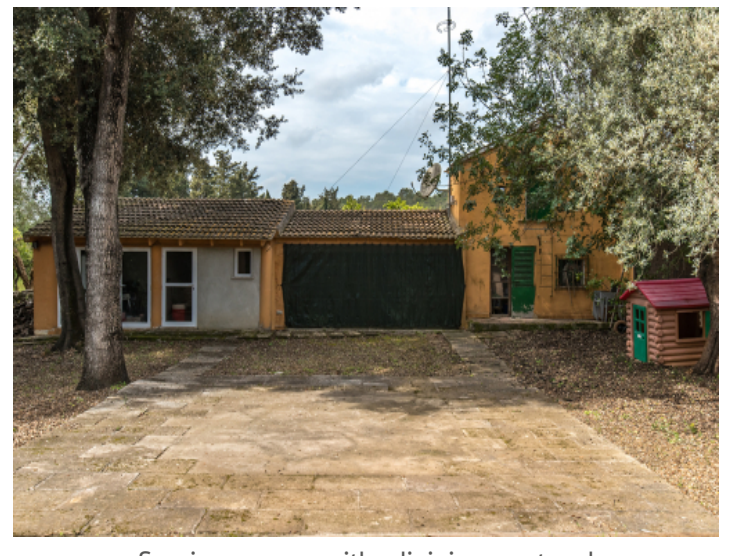
Spacious garage with adjoining courtyard