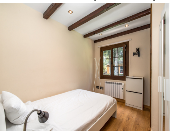
Second bedroom with garden view