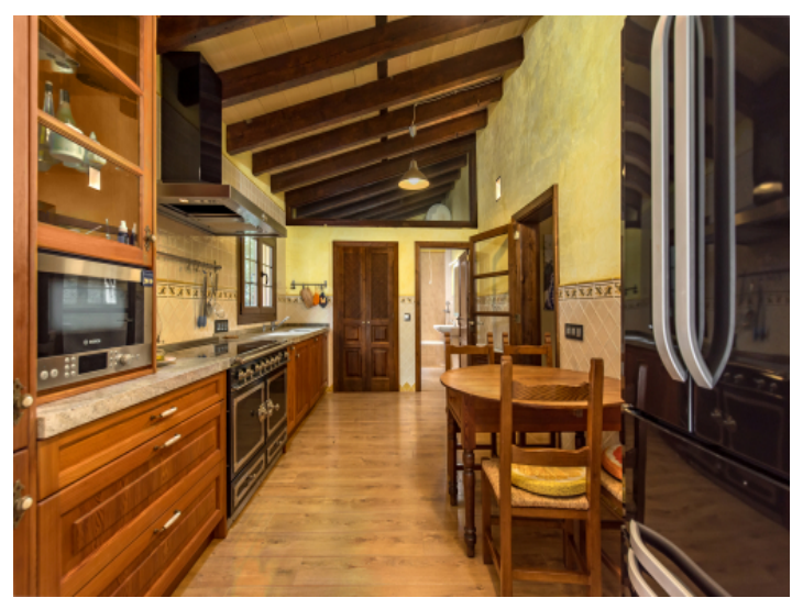
Open-plan kitchen with dining area