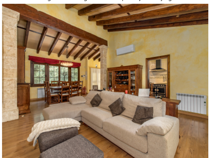
Spacious lounge area with fireplace