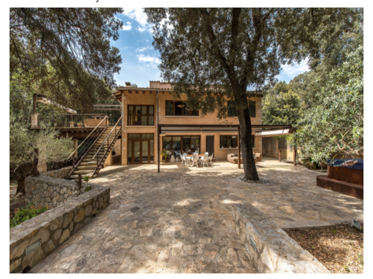
Elegant chalet in Mediterranean style