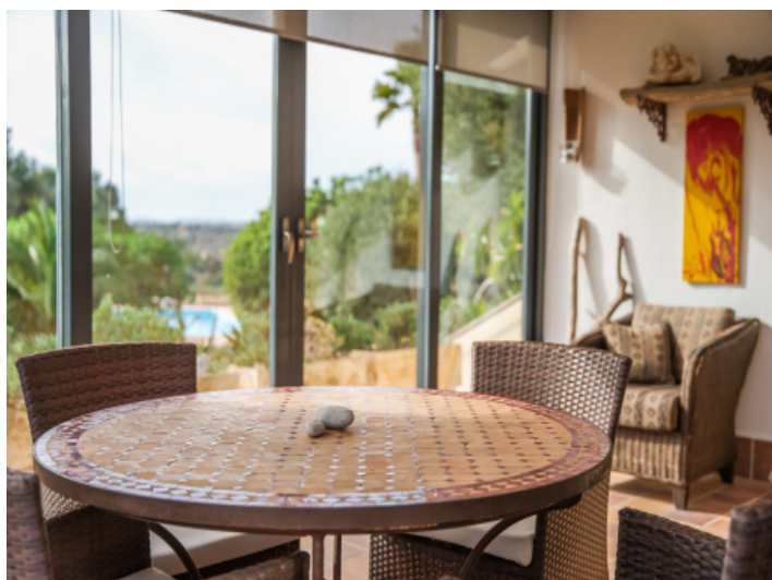
Dining room with large windows