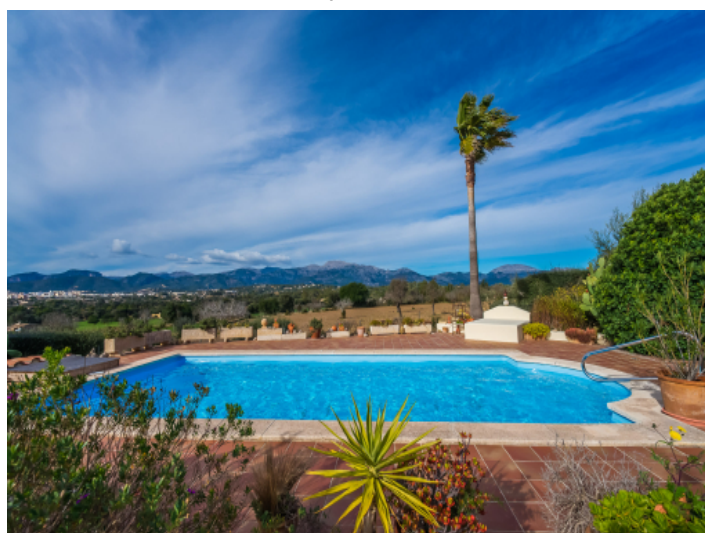
Elegant pool area