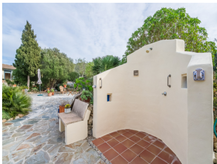
Covered terrace with garden view