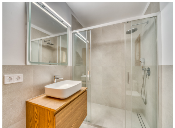
Bathroom with walk-in shower