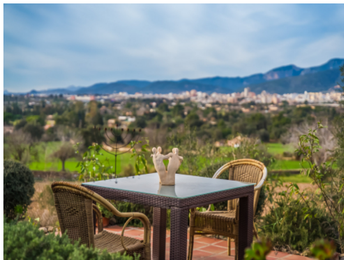
Cozy conservatory with sitting area