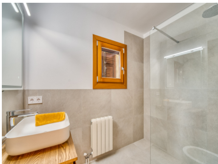
Bathroom with window and washbasin