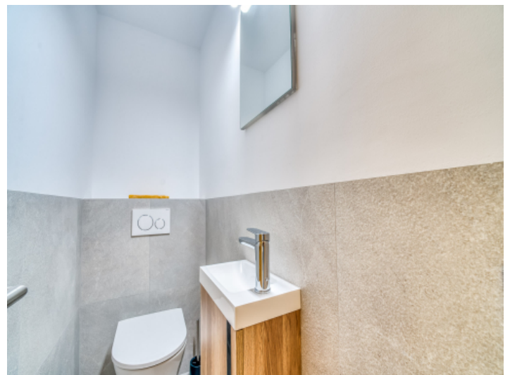
Modern bathroom with shower