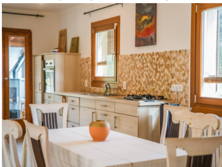
Cozy living area with reading corner