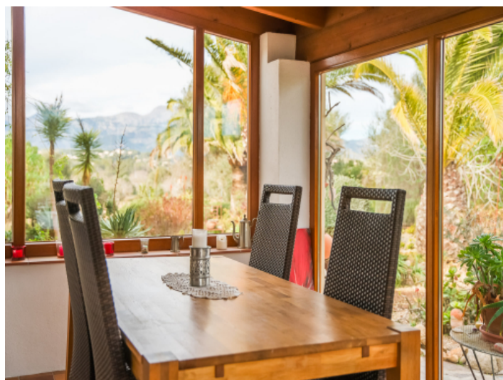
Open living area with sofa and fireplace