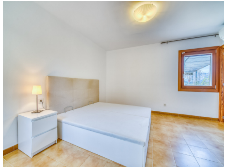
Bright bedroom with window