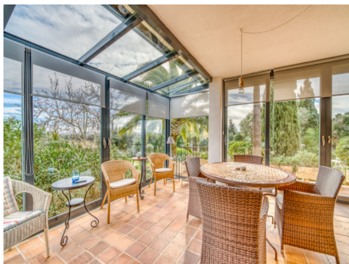
Wintergarten mit Gartenzugang