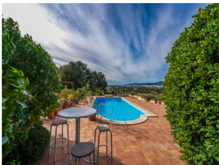
Pool with natural stone terrace