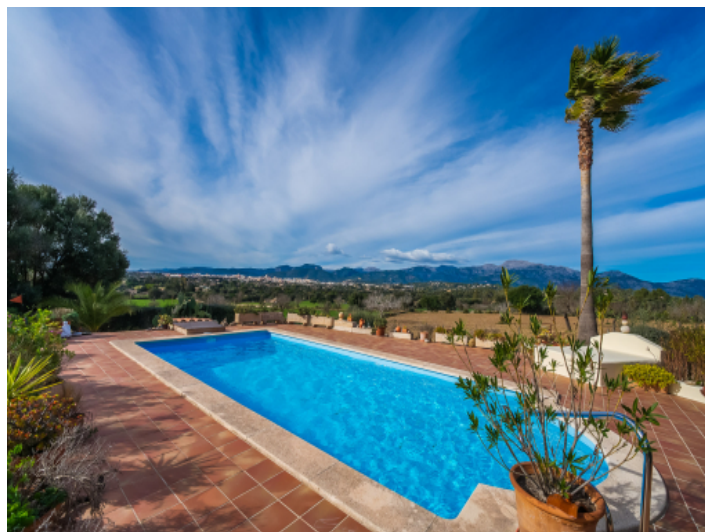
Pool area with palm trees