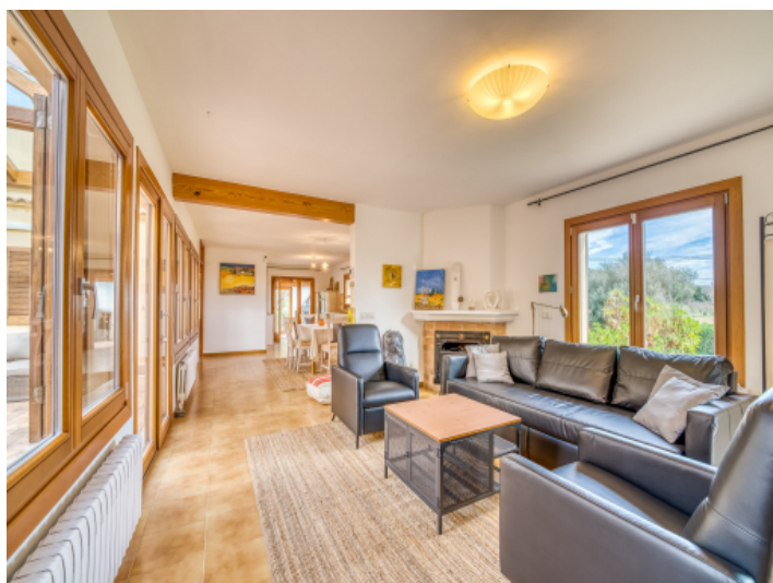
Bright dining room with natural light