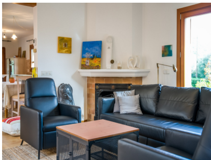
Living room with garden view