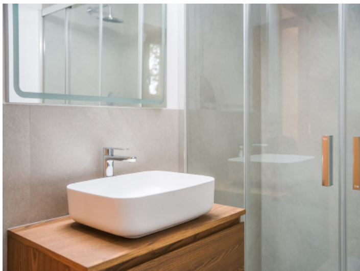
Stylish bathroom with natural light