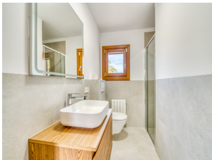
Bathroom with bathtub and natural stone