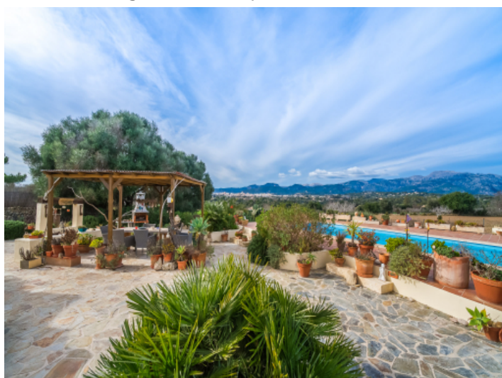
Spacious conservatory with glass roof