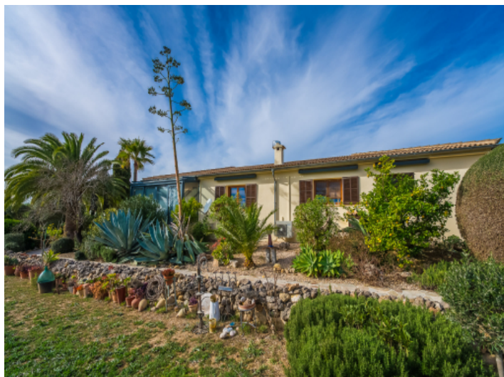
Mallorcan architectural style