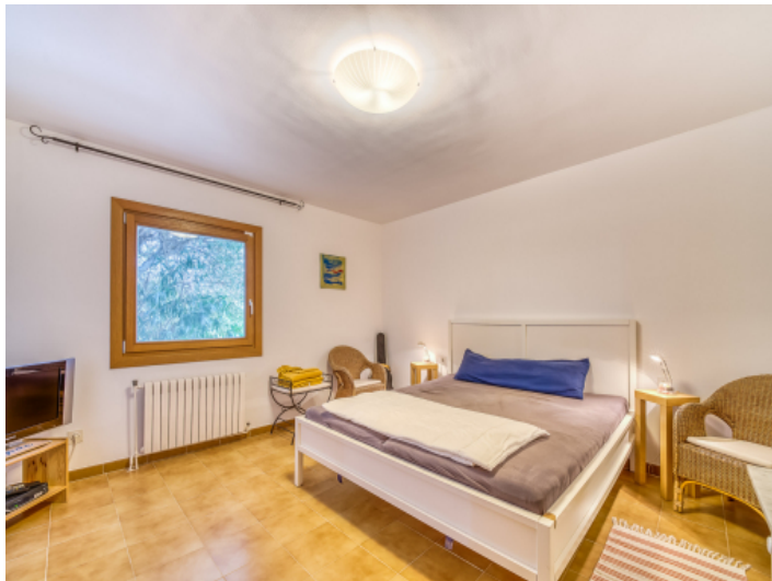
Fully equipped fitted kitchen