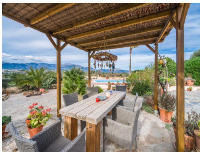
Conservatory with open views