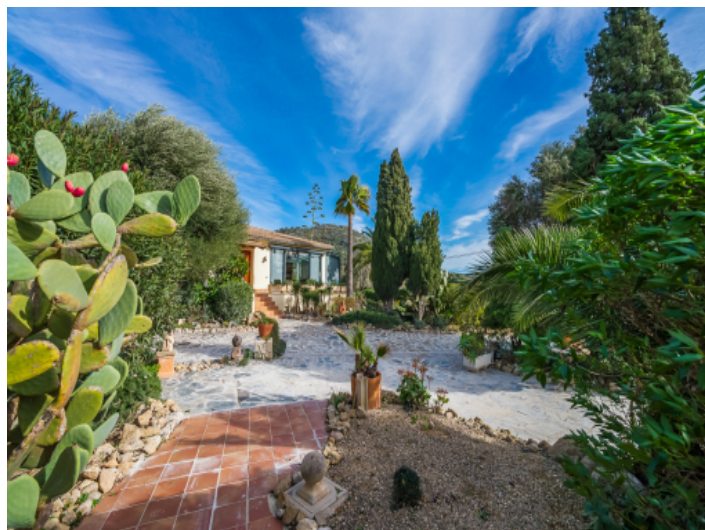
Lush garden area