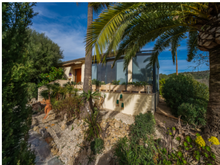
Garden with palm trees and natural views