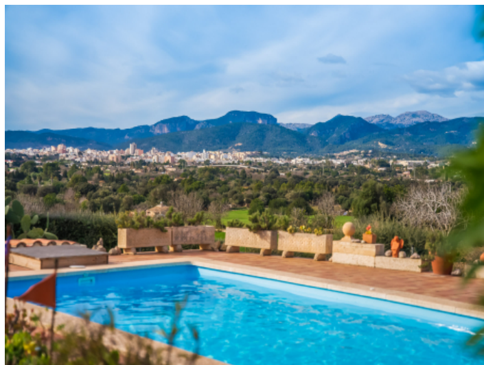
Pool with panoramic view