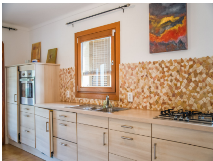
View from the dining area to the garden