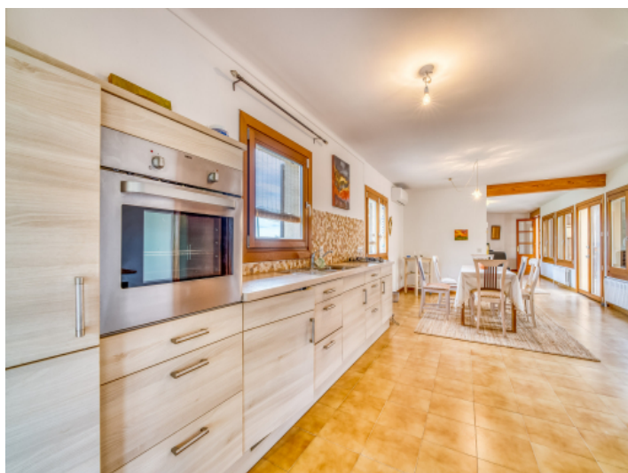
Elegant dining area for social gatherings