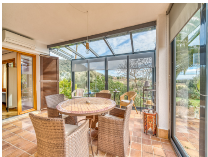
Living room with natural light