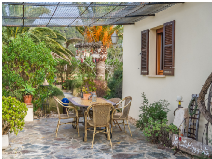
Bright conservatory with nature views