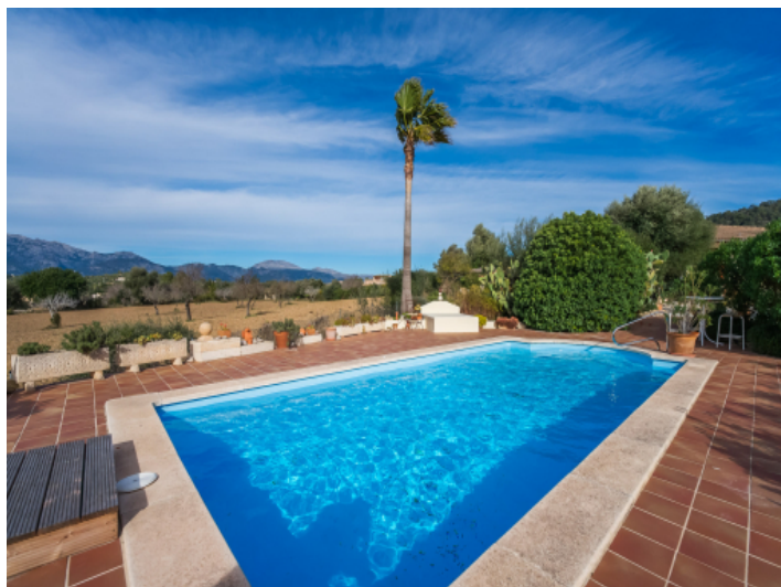
Swimming pool with sun terrace