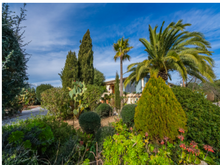
Mediterranean garden with palm trees