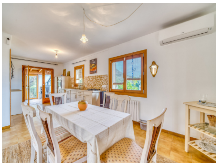
Modern kitchen with wooden details