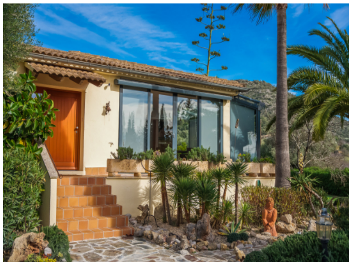
Facade with natural stone