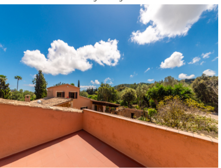
View from the upper terrace