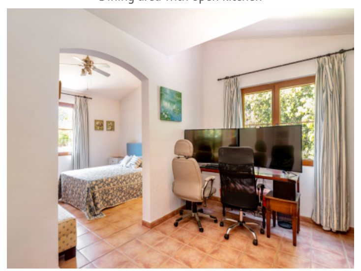
First bedroom in the left wing