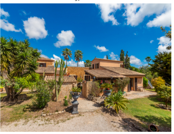
Finca in Arta