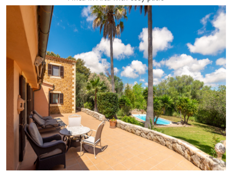
Terrace at the back