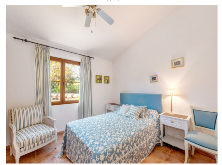
Bedroom in left wing