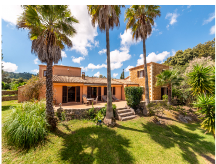
Finca from the pool side