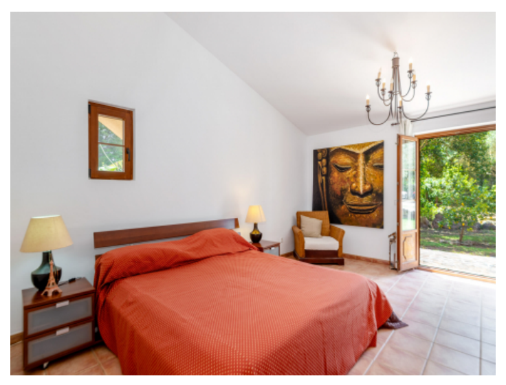
Third bedroom in the right wing