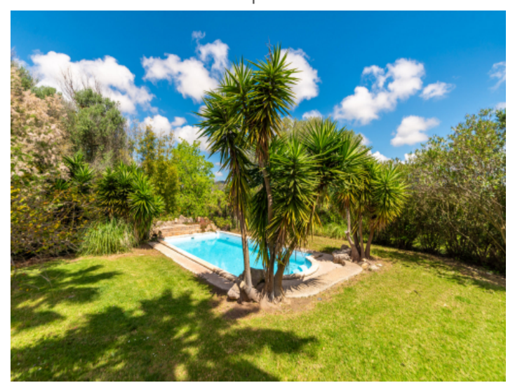
Pool and garden