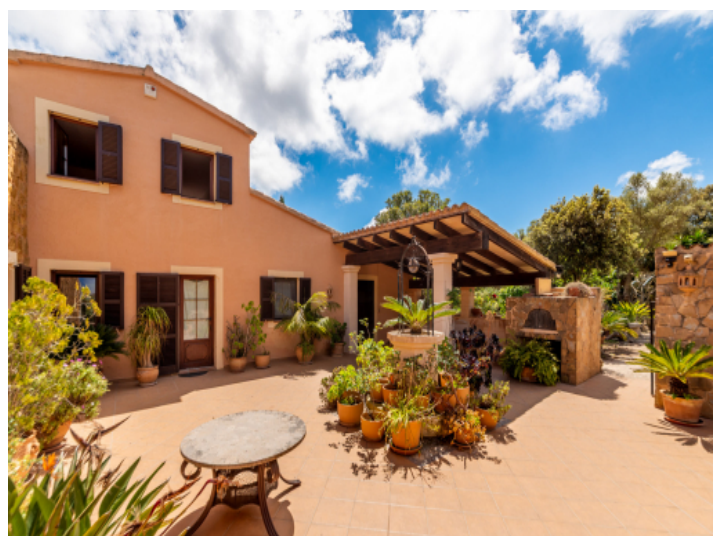
Finca and patio