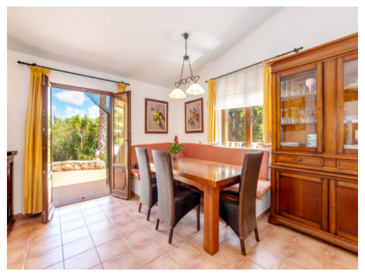
Dining area with open kitchen