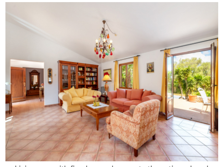
Living area with fireplace and access to the patio and pool