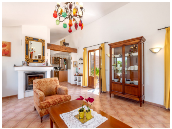
Outdoor Living area