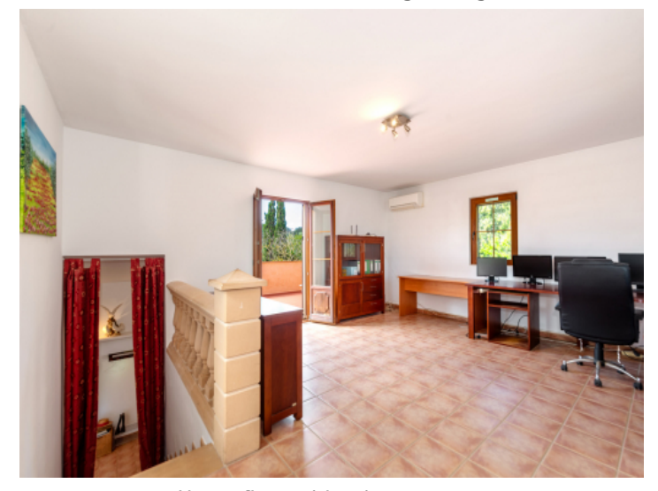
Upper floor with private terrace