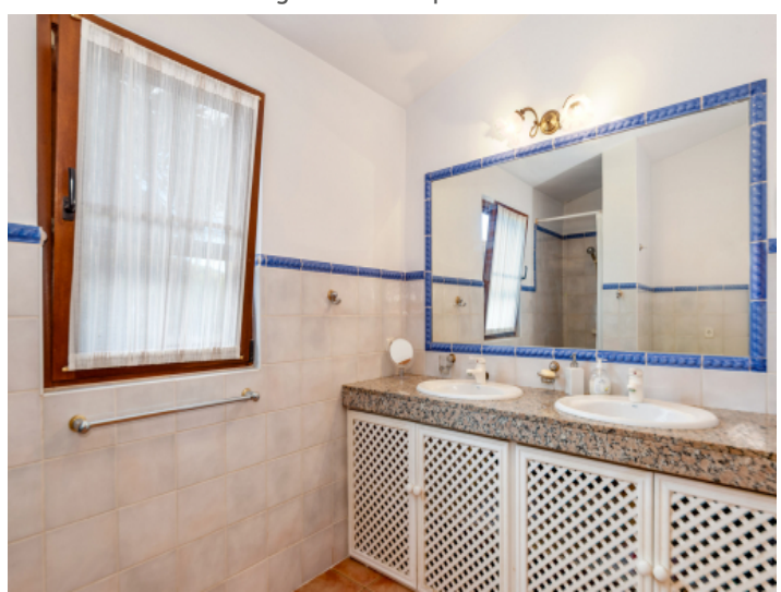
Bathroom in the left wing