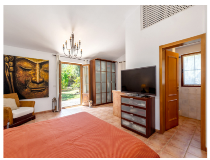
Third bedroom in the right wing with en suite bathroom