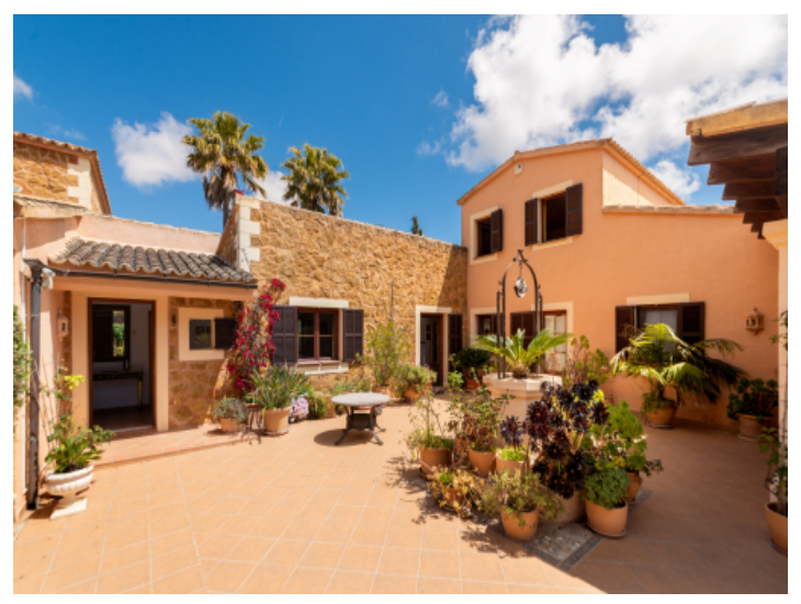
Finca in Artà with cosy patio