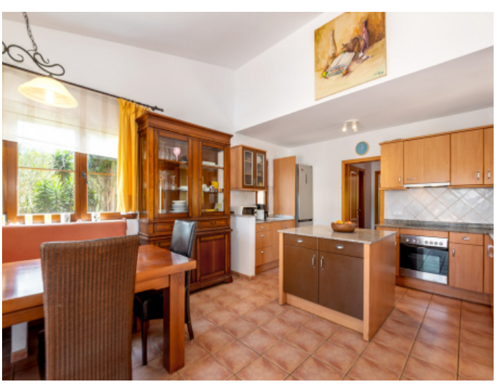
Dining area with open kitchen