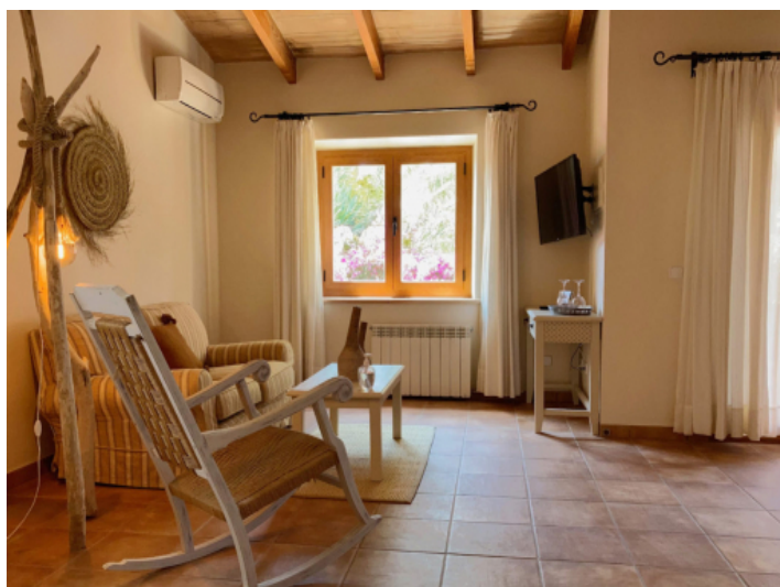
One of 9 junior suites