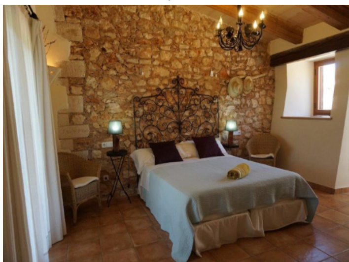
One of 9 junior suites