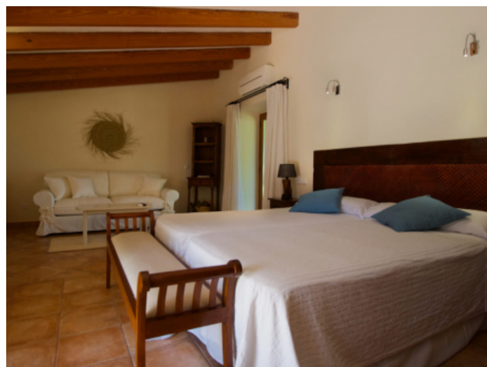
One of 9 junior suites