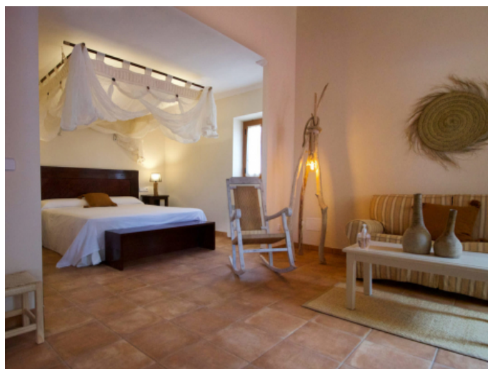
One of 9 junior suites