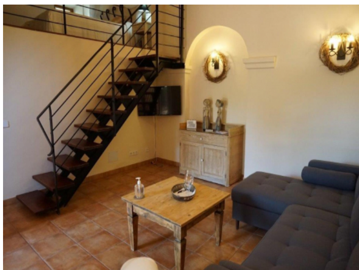
One of 9 junior suites