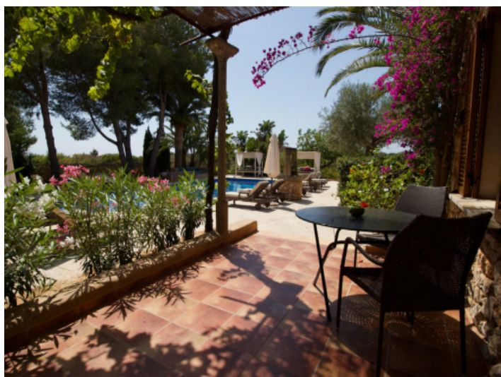
Inviting outdoor area