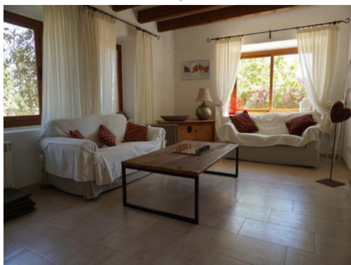
Cosy communal area