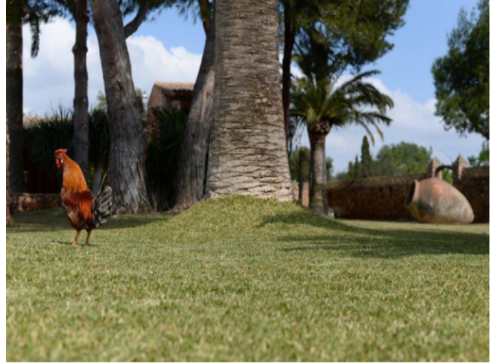
Quiet country life