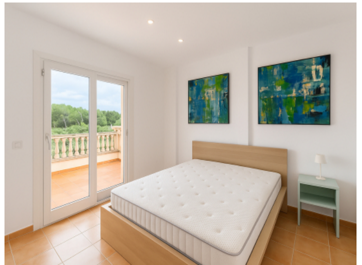
Second double bedroom on the upper floor