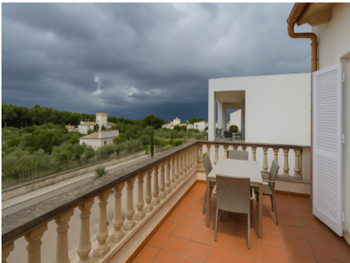
Terrace with sea views