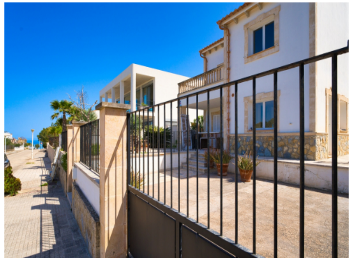
Gated property with sea view in a quiet residential area