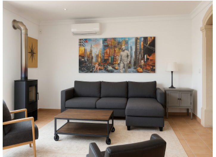
Stylish living room with wood-burning stove and air