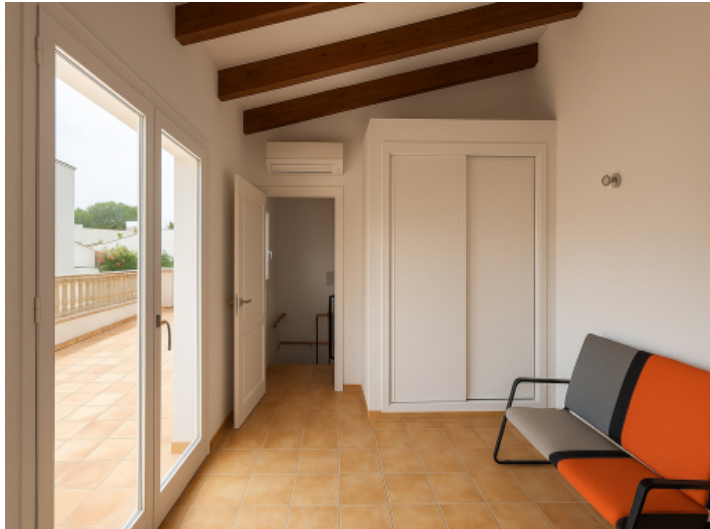
Third bedroom on the upper floor