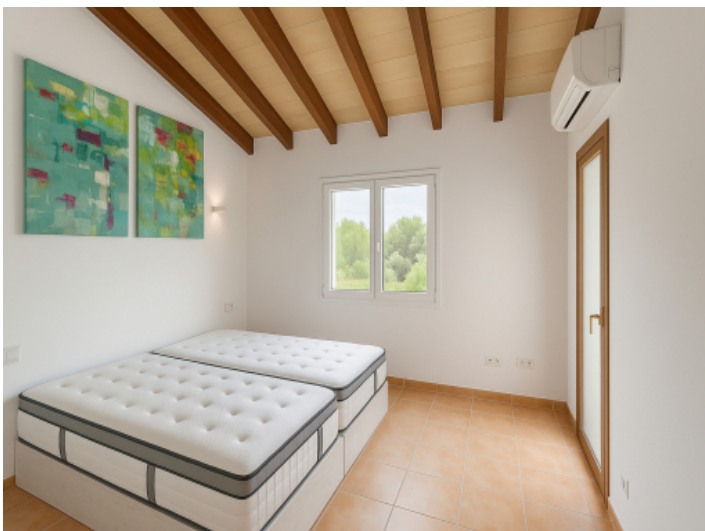
Master bedroom on the upper floor