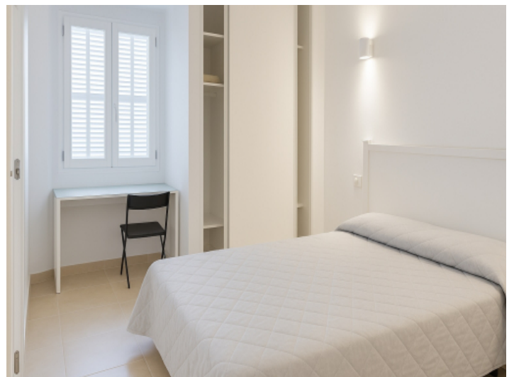
Ground floor master bedroom with built-in wardrobe and desk

PORTA MALLORQUINA • C./ COLOM 20 2º, 07001 PALMA, SPAIN