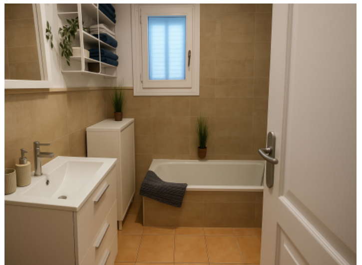
Bathroom on the upper floor