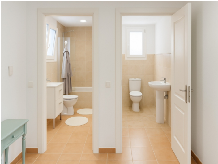
En-suite bathroom on the left & separate guest WC on the