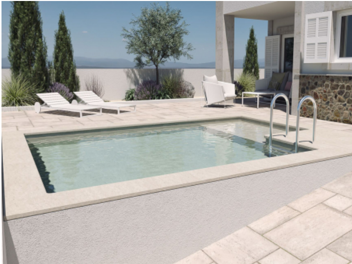
Rendered image of the planned swimming pool – your future