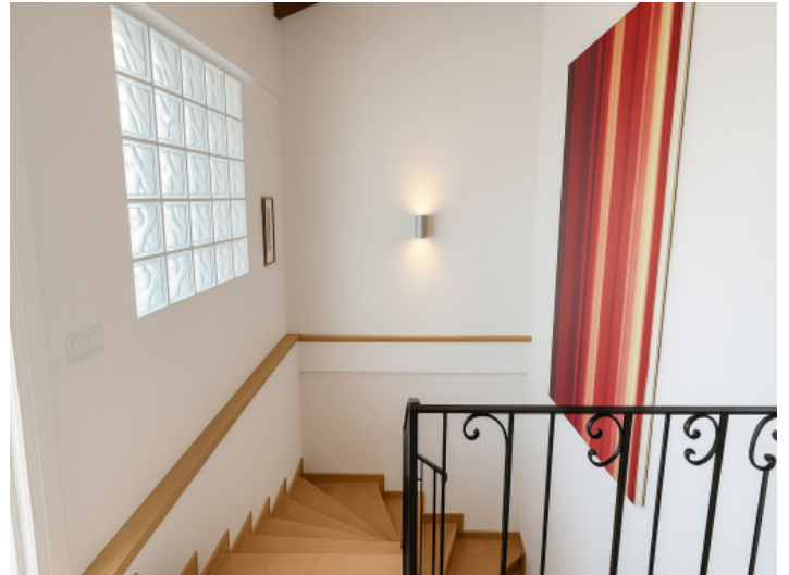
Bright, light flooded staircase