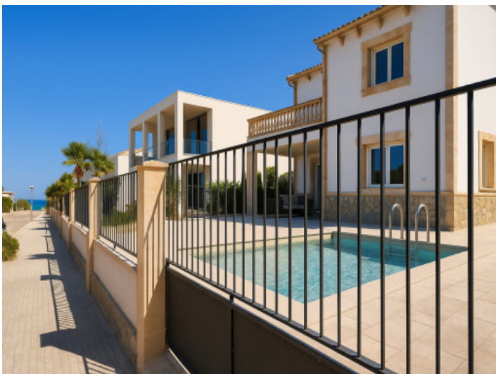
Photomontage of the future pool with sea view – prime location living