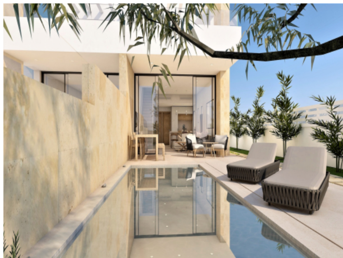
Pool with sun terrace