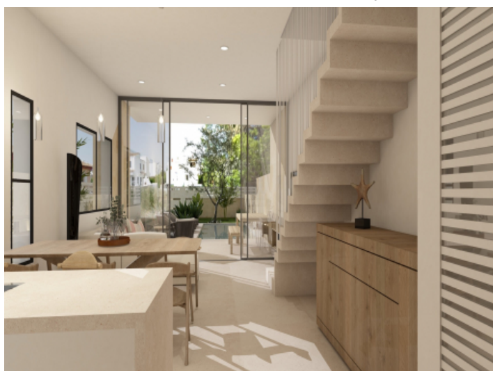
Openly-designed living and dining area