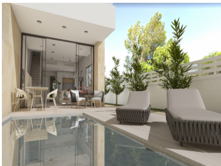
Fantastic semi-detached house with pool