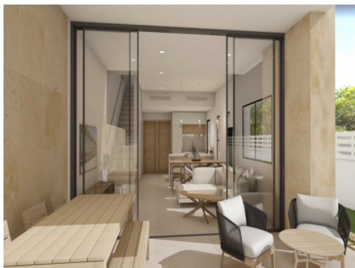
Covered terrace with inviting seating area