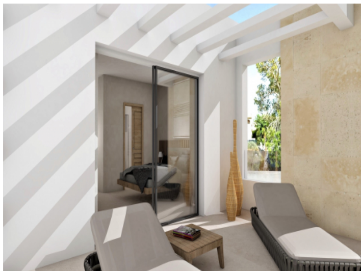
Private terrace from the master bedroom