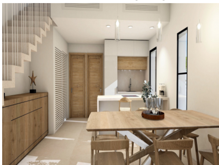
Cosy dining area with integrated kitchen