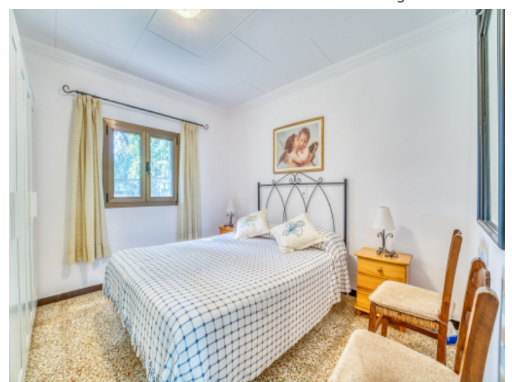
Second double bedroom