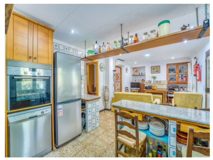
View from the kitchen into the living area