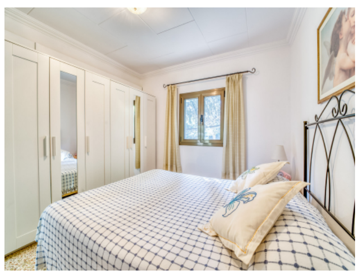
Second double bedroom with built-in wardrobes