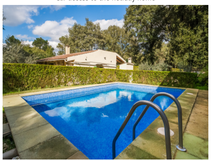
Privately located swimming pool