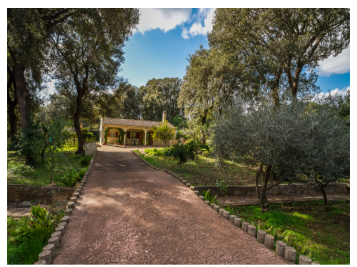
Car access to the holiday home