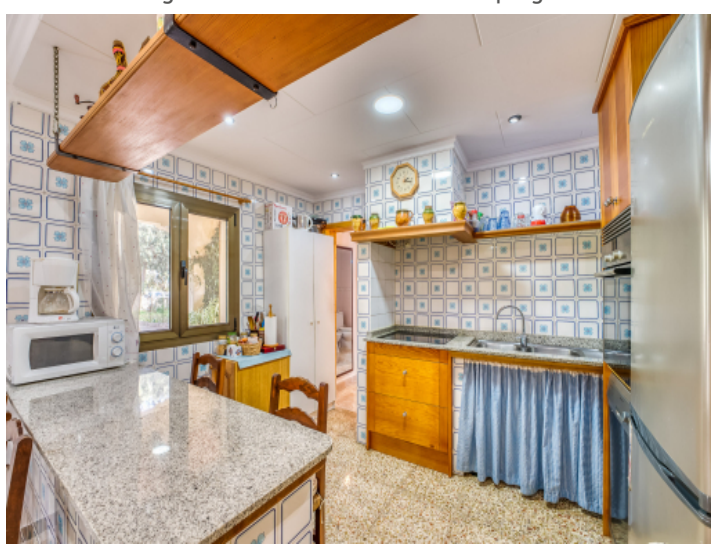
Fully equipped open kitchen