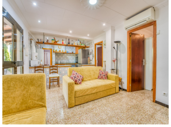
Open living area to the kitchen