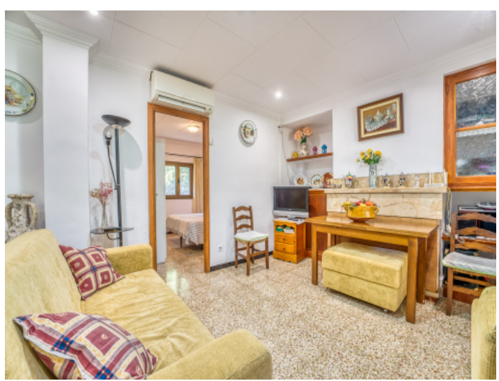
Living room with access to the sleeping areas