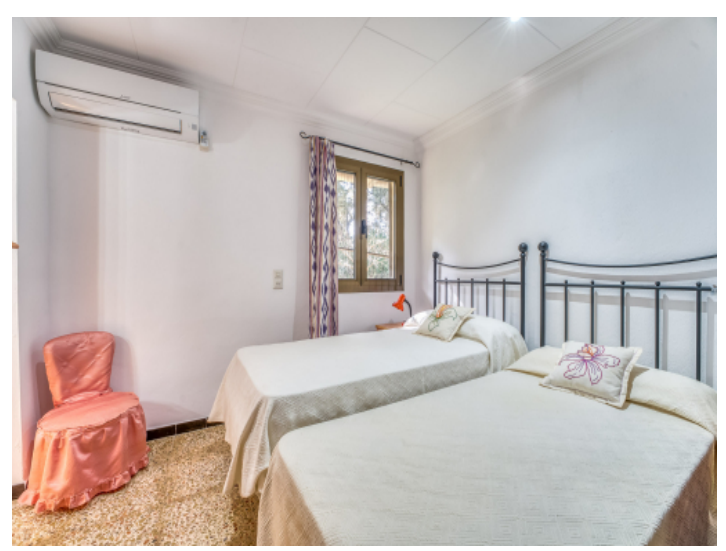
Master bedroom with air conditioning