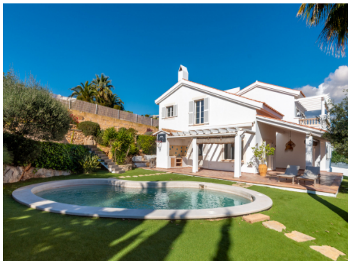
Garden and pool