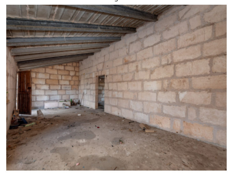
Kitchen First floor