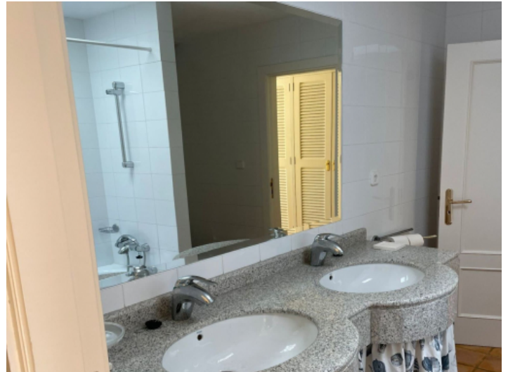
One of 8 bathrooms