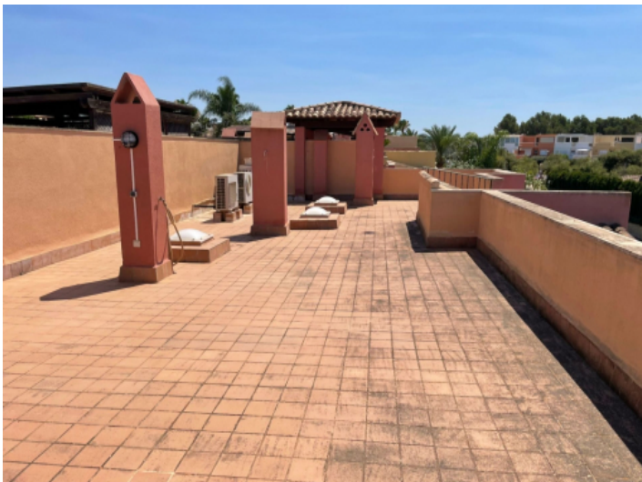
Roof top terrace