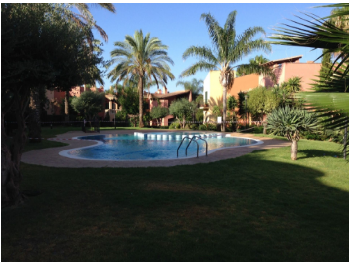
Community garden and pool