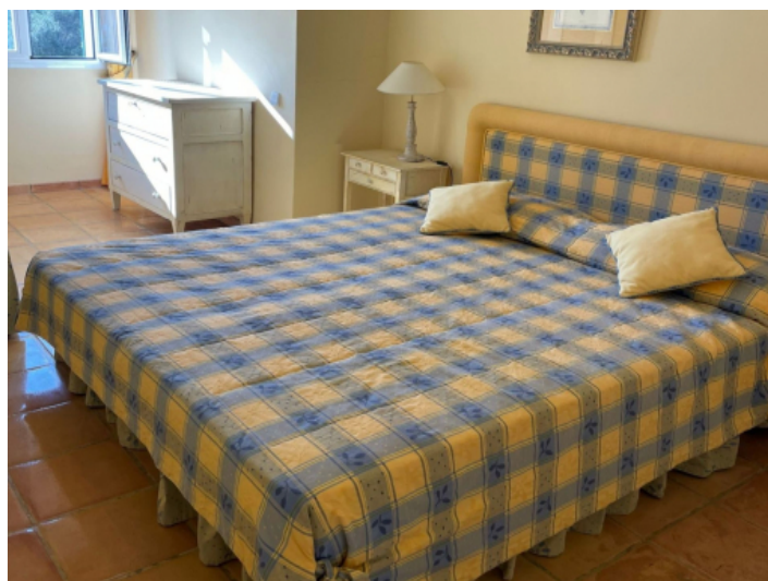
One of 8 bedrooms