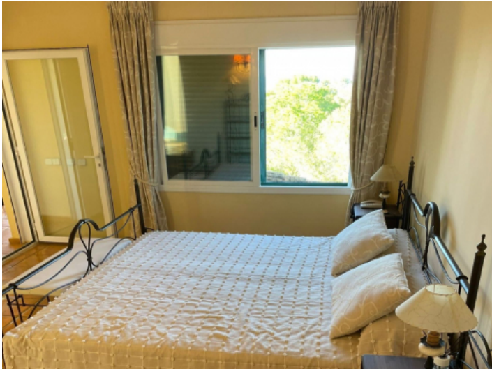
One of 8 bedrooms