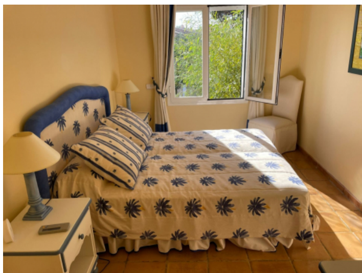
One of 8 bedrooms