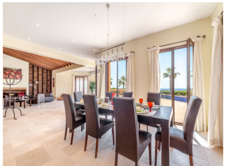
Lightflooded dining area with terrace access