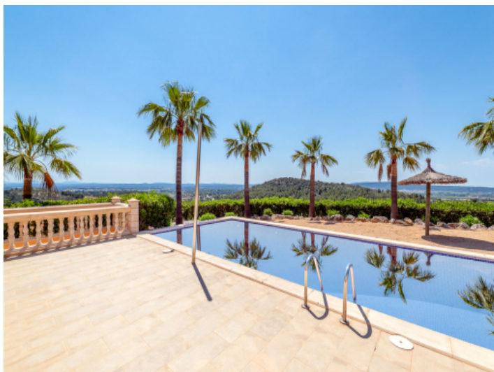
Pool area with beautiful sweeping views