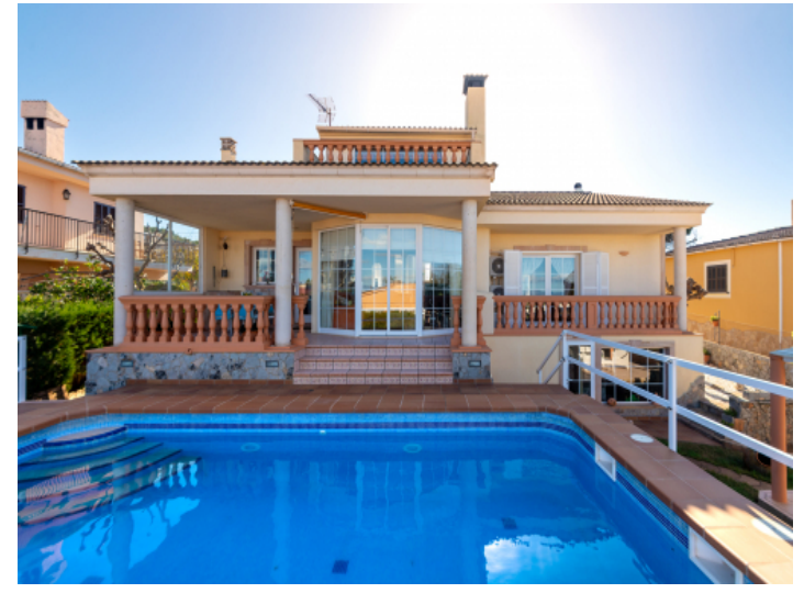
Exclusive villa with spectacular sea views in Bahía Azul