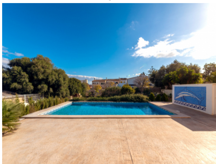
Pool and terrace