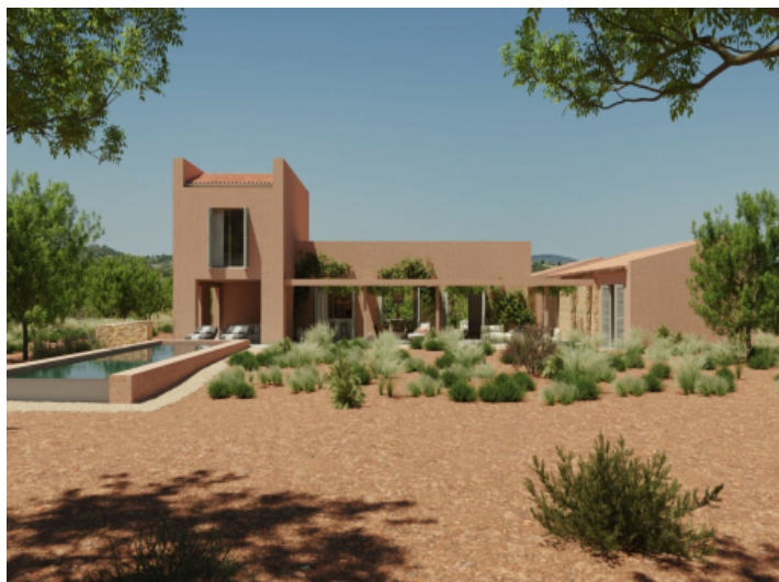
Large plot with great project near Cala Mendia