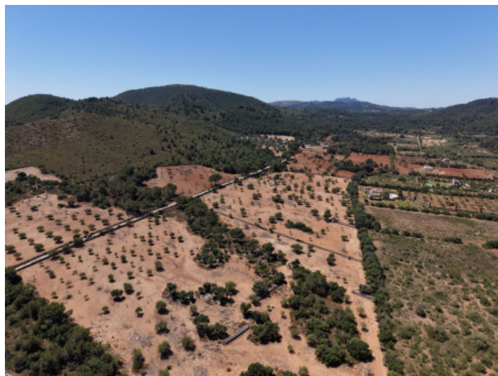
Mountain and sea view