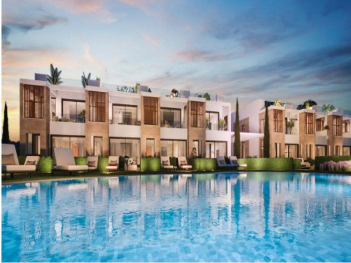
Large community pool°