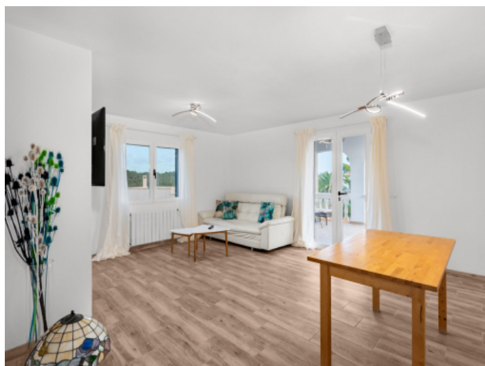
Living and dining area 1. floor