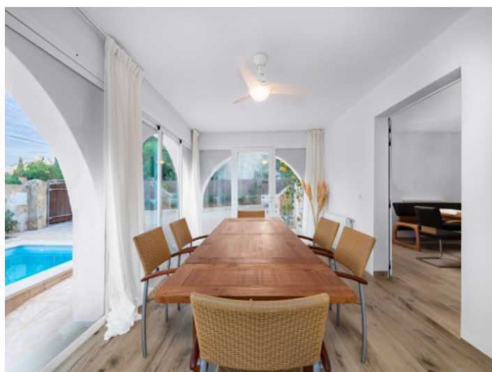
Dining area conservatory