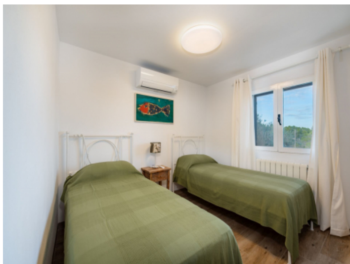
Second bedroom 1. floor