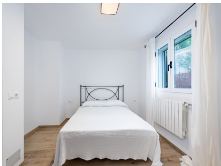
Second bedroom groundfloor