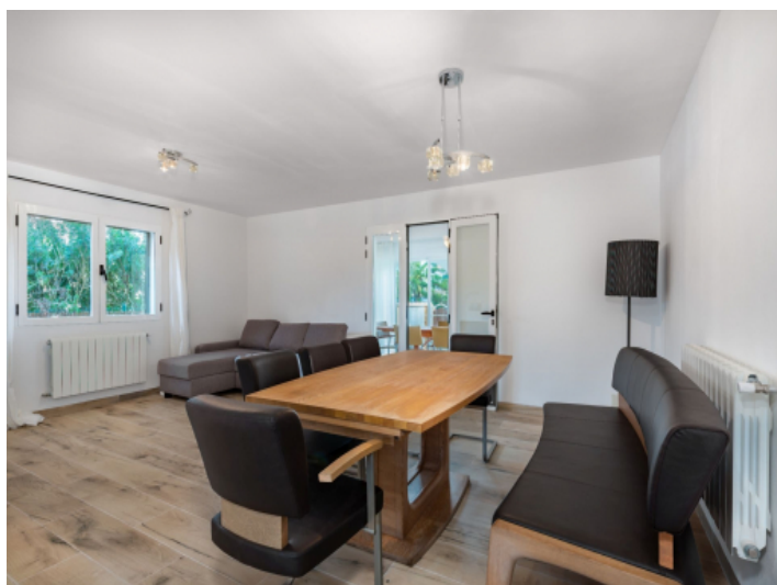
Living and dining area groundfloor