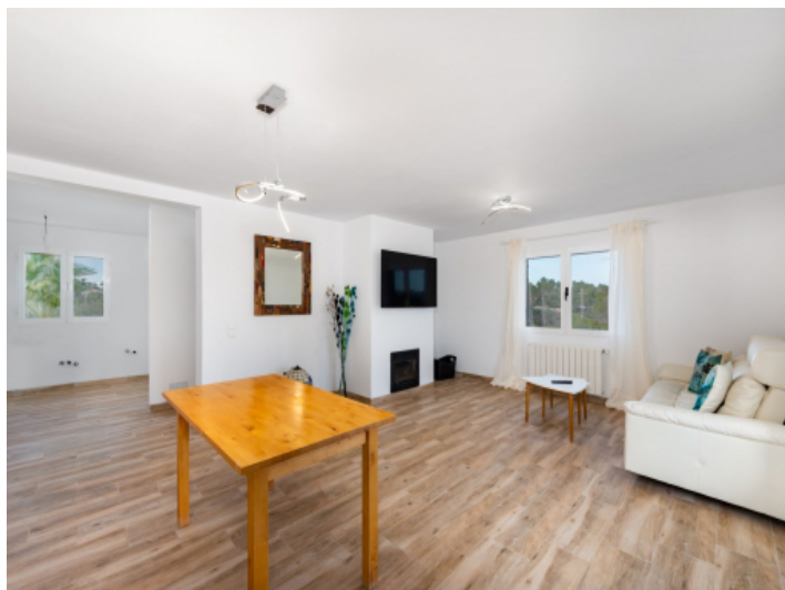
Living and dining area 1. floor