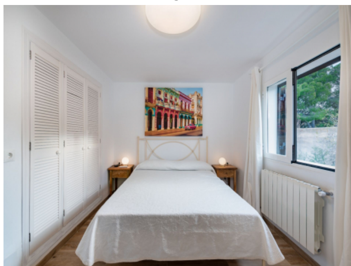
Bedroom 1. floor