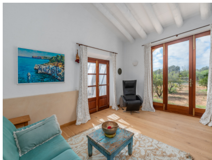
Chill out area