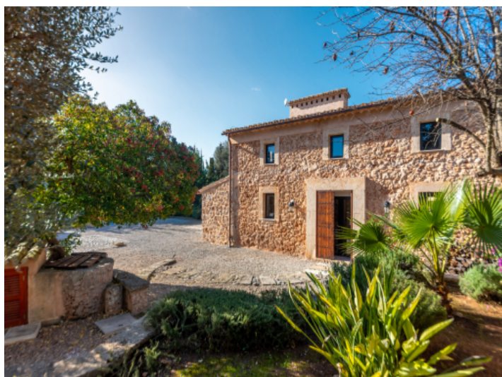
Beautiful mallorcan finca