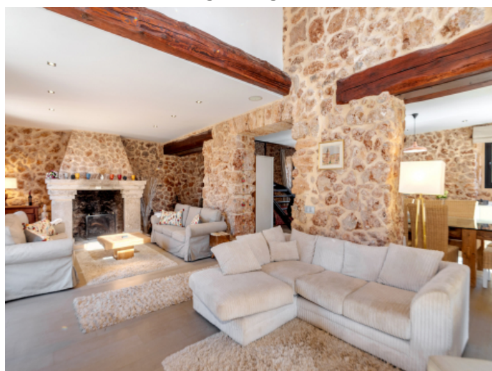
High ceilings and natural stone walls