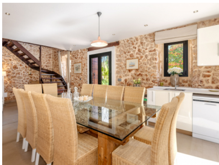
Dining area close to the kitchen