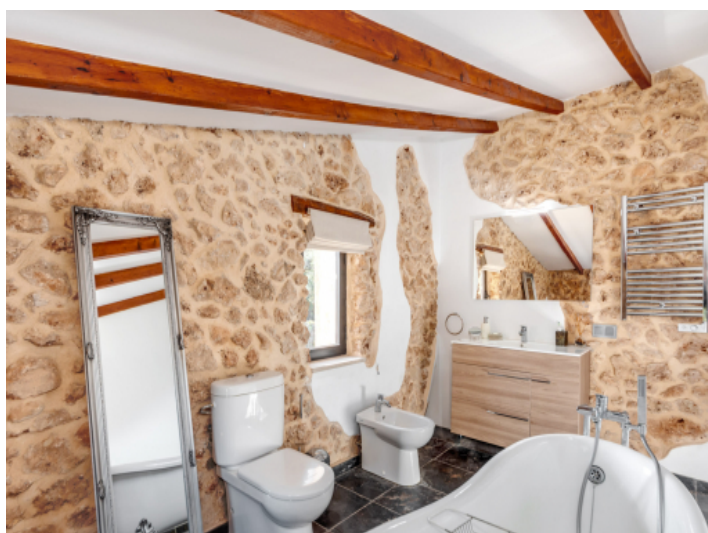
Fully equipped bathroom