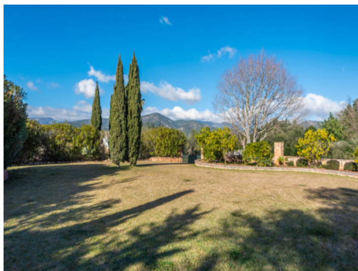
Very well maintained garden