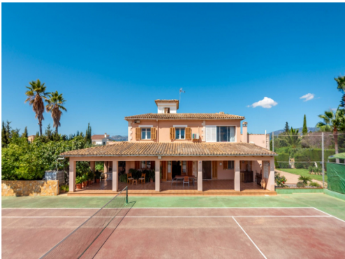
Façade and tennis court