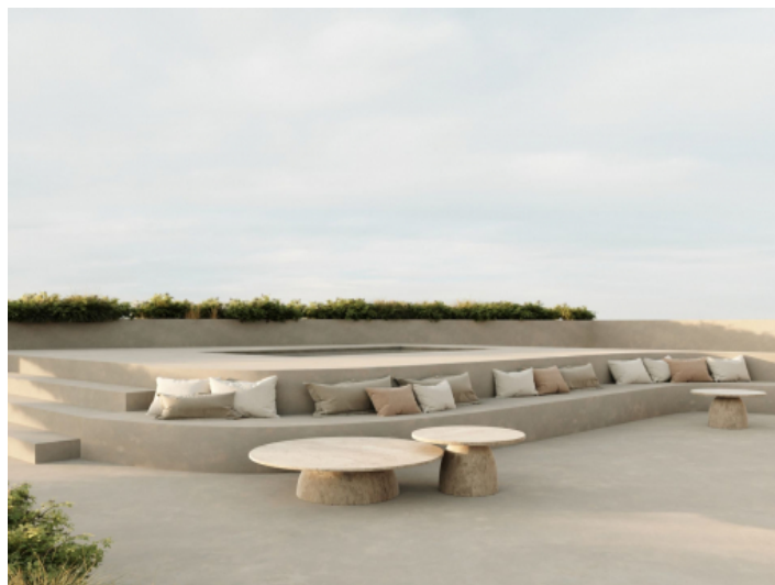
Relax close to the jacuzzi on the rooftop