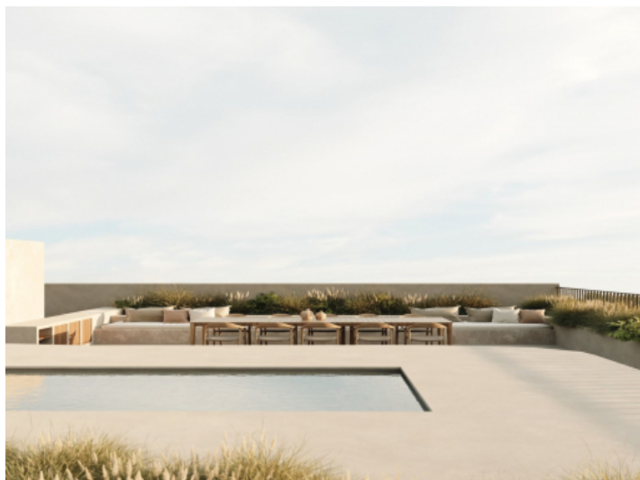
Beautiful Pool in the patio