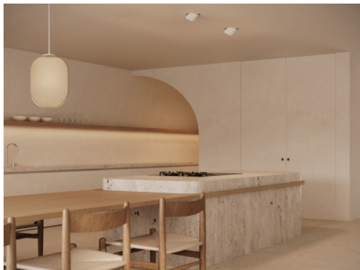
Nice cooking island