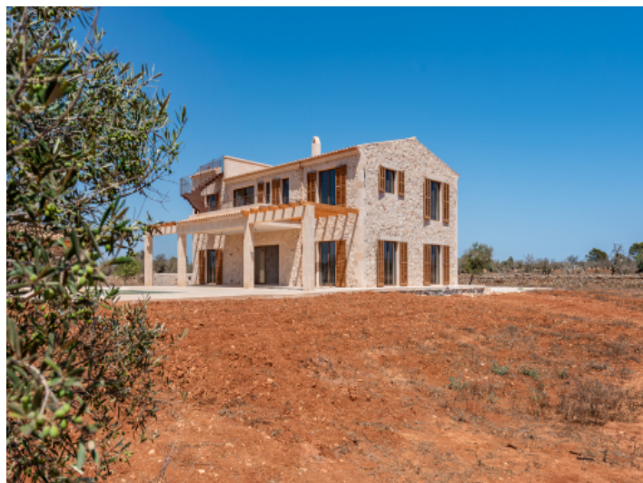
View to the property