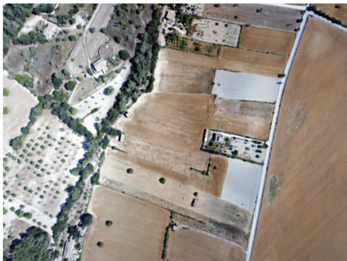
Aerial view of the plot