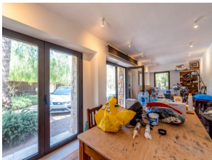
Room in the anex