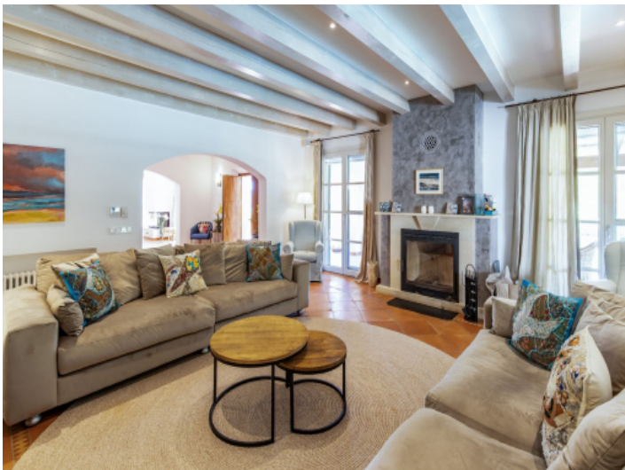
Elegant living area with fireplace