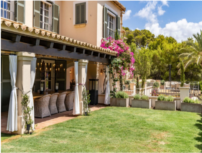
Villa in top location