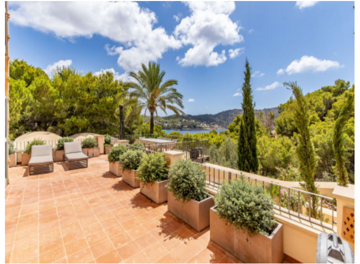
Terrace with sea view