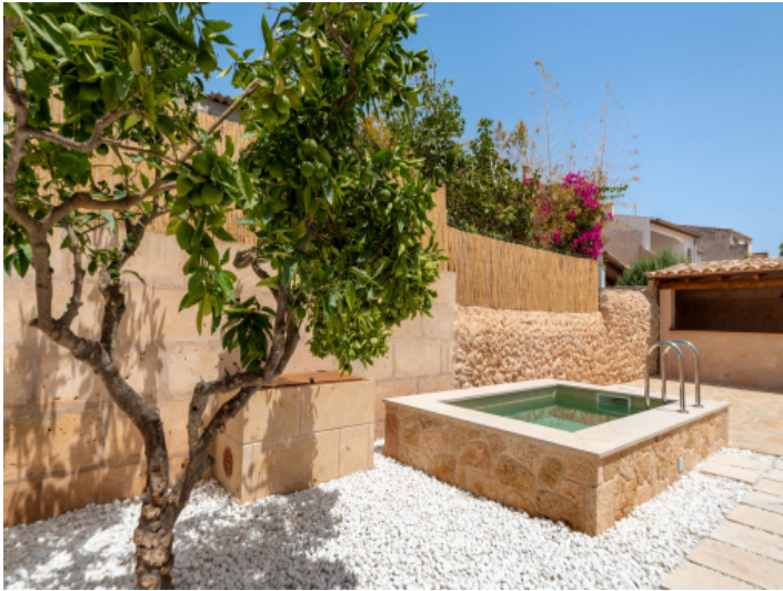
Patio with pool