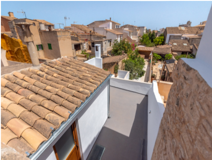
View from the rooftop over the neighborhood