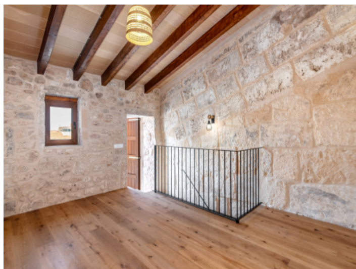
Natural stone walls