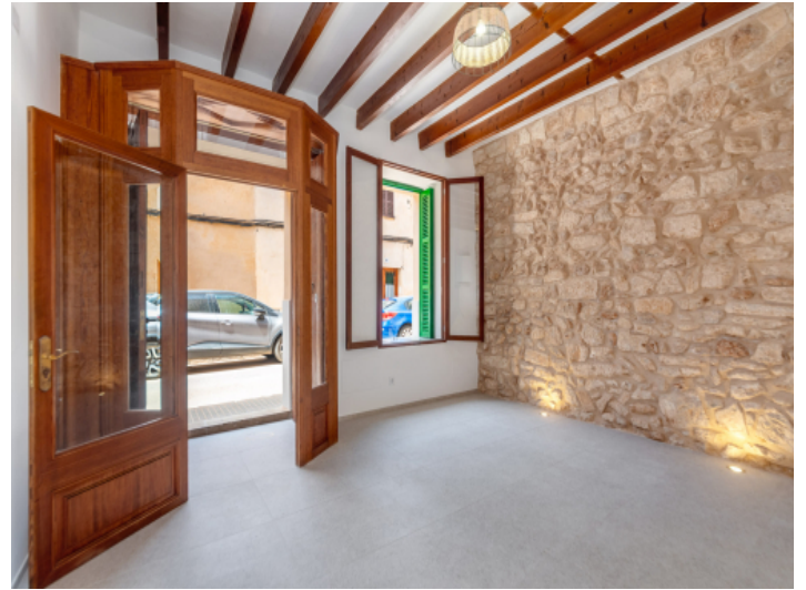
Typical entrance to a Mallorcan village house