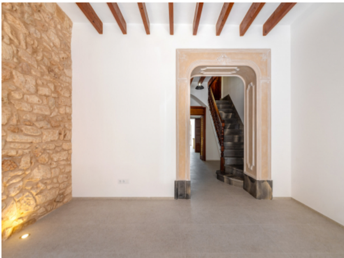
Living area and staircase to the first floor