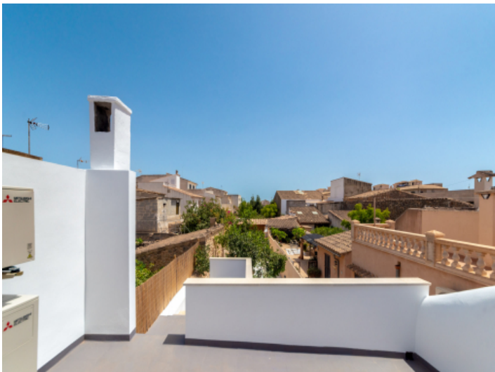
Rooftop terrace with views