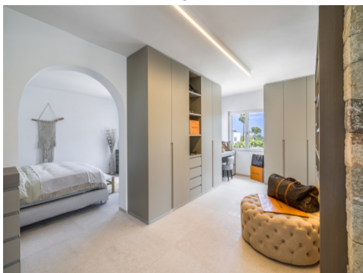
Bedroom with walk-in wardrobe