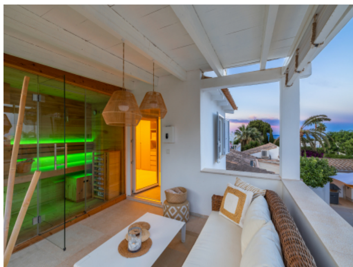
Sauna with sea views