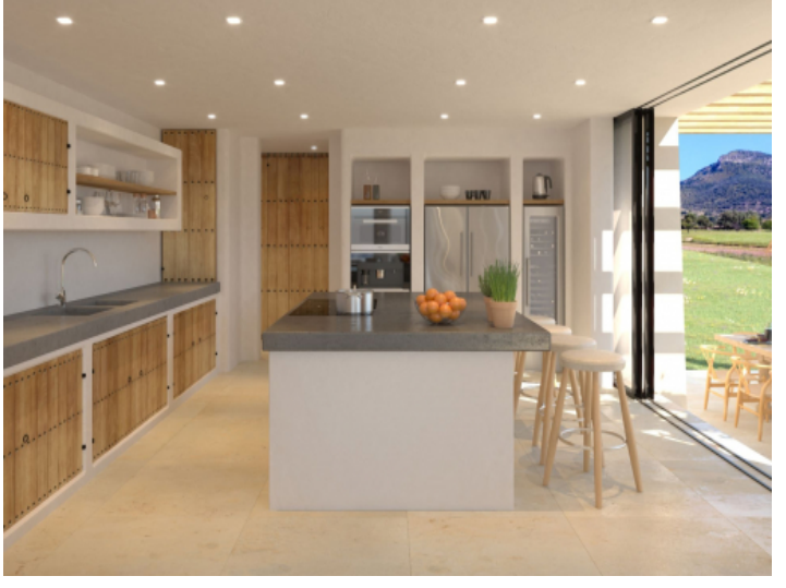
Kitchen with large kitchen island