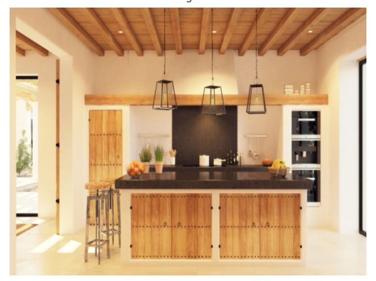
Country style kitchen