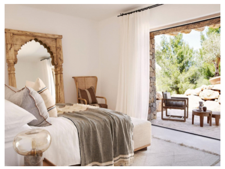
One of 6 bedrooms