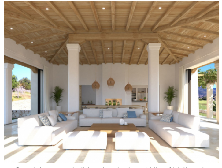
Prestigious new-build project in the middle of Mallorca's