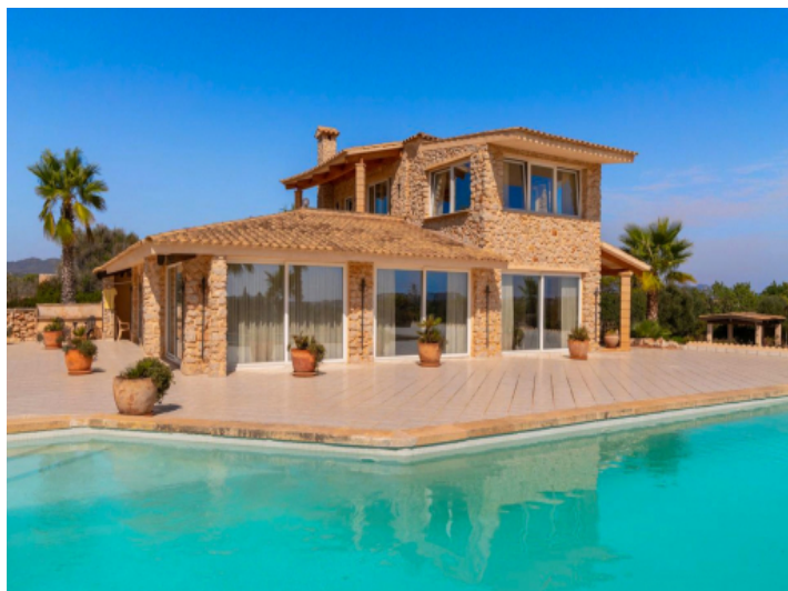
house, Son Carrio