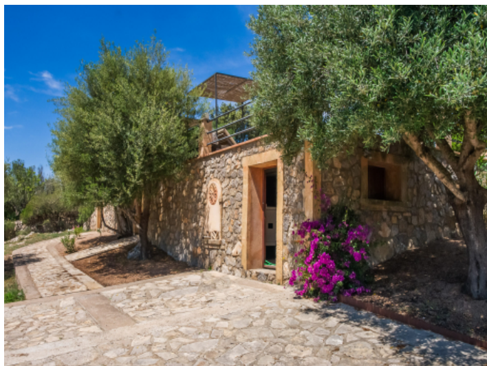
Engine room under the pool