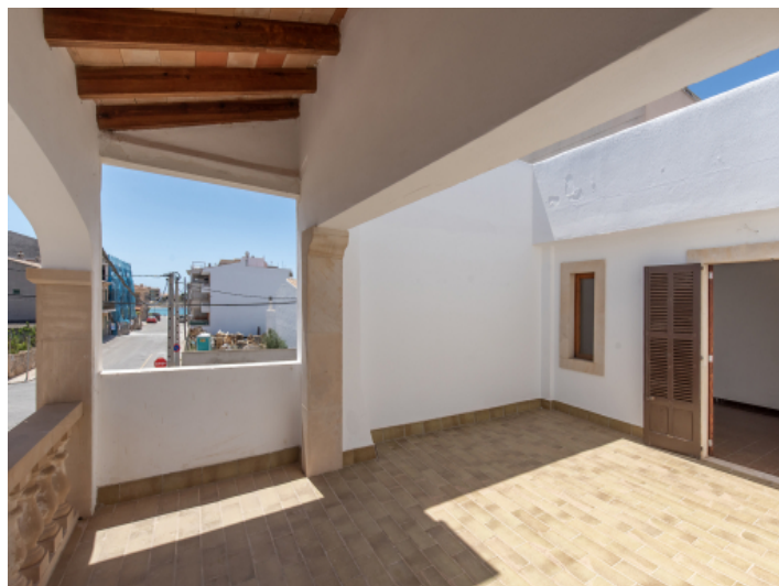
Lateral sea view