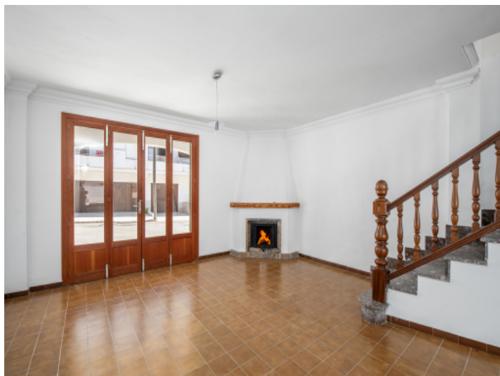
Entrance area with fireplace