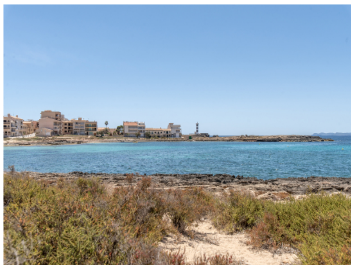
Colonia St. Jordi