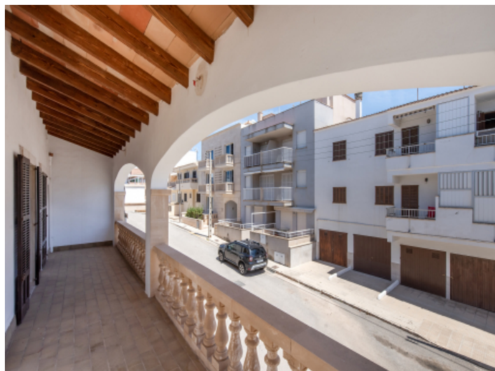
Views over the neighborhood