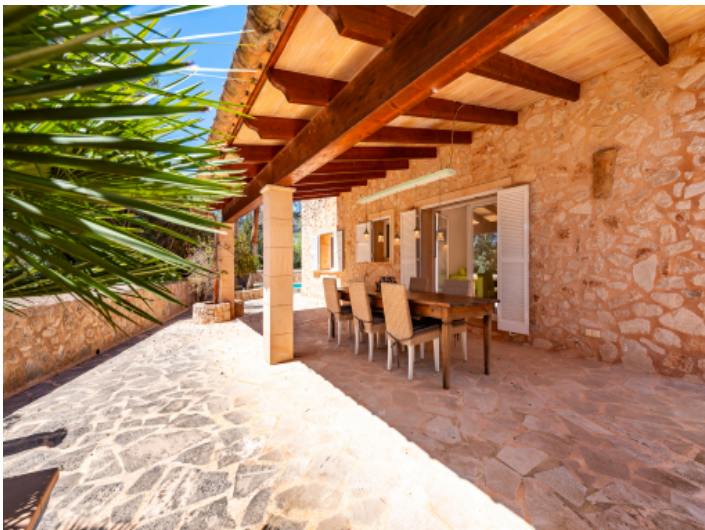
Natural stone walls