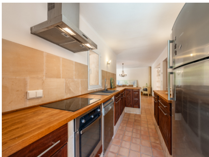
Very nice kitchen