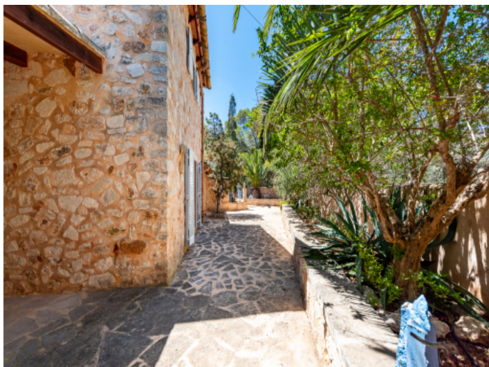
Mallorcan country lifestyle