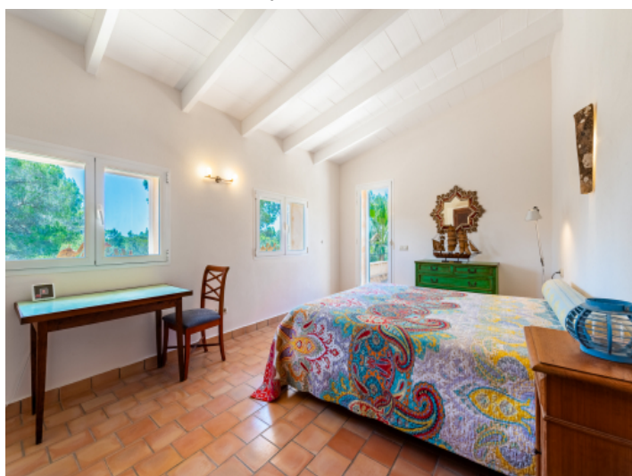
Bedroom with private terrace