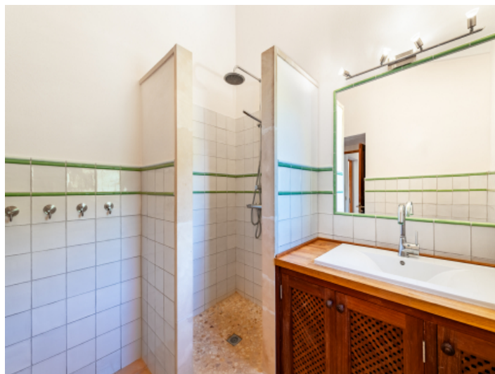
One of 2 bathrooms