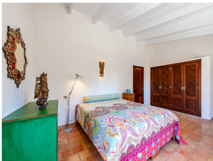
One of 4 bedrooms