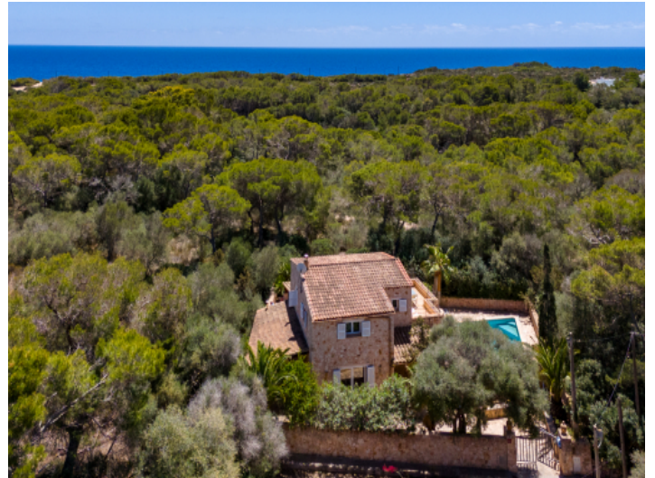
Close to the beach