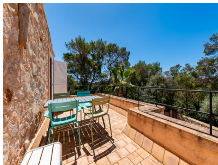
Terrace from the bedroom