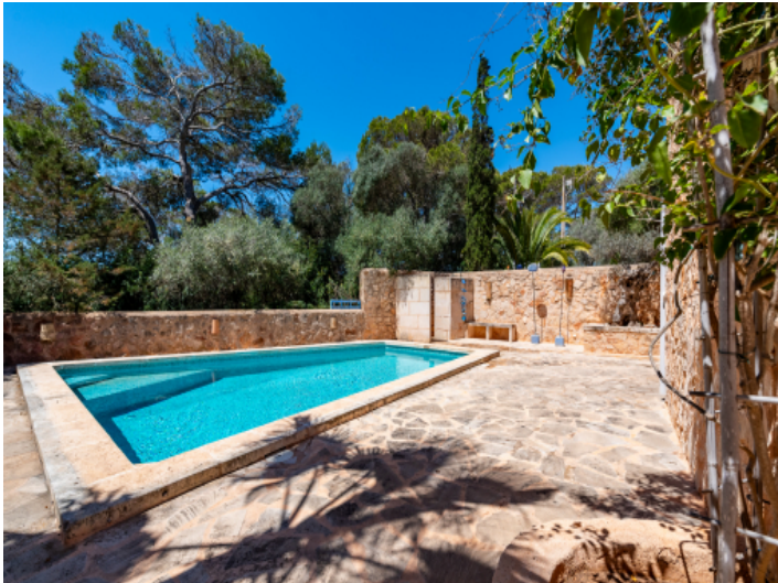
Pool with privacy