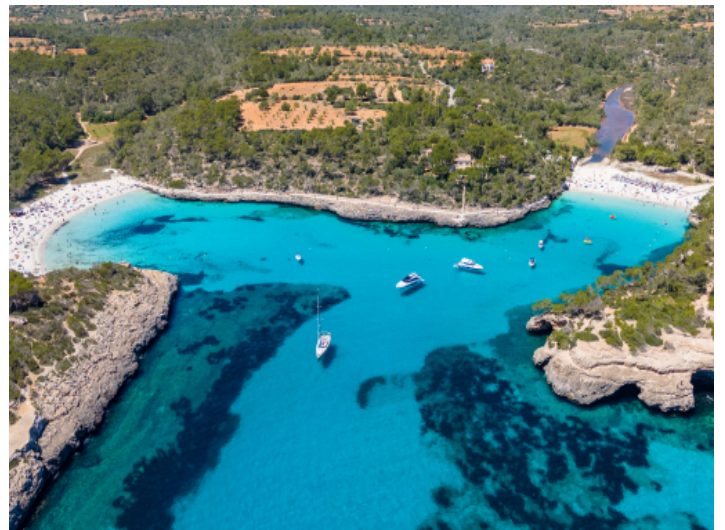
Cala Mondrago and Cala S'Almunia