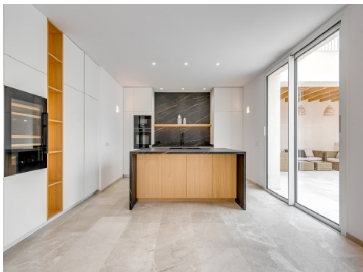
Modern kitchen with kitchen island