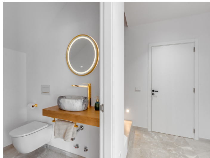
Guest toilet on the groundfloor