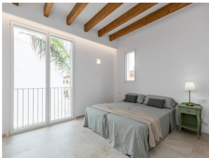
All bedrooms with bathroom en suite