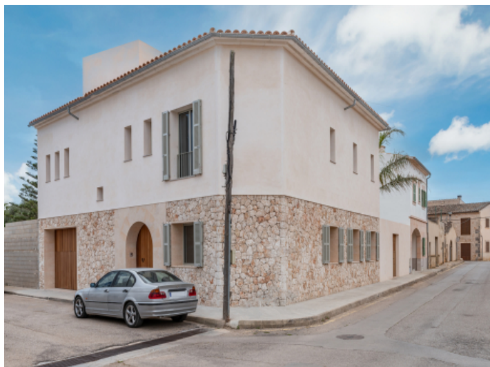
Streetview to the townhouse