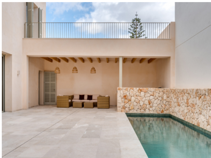
Patio with pool