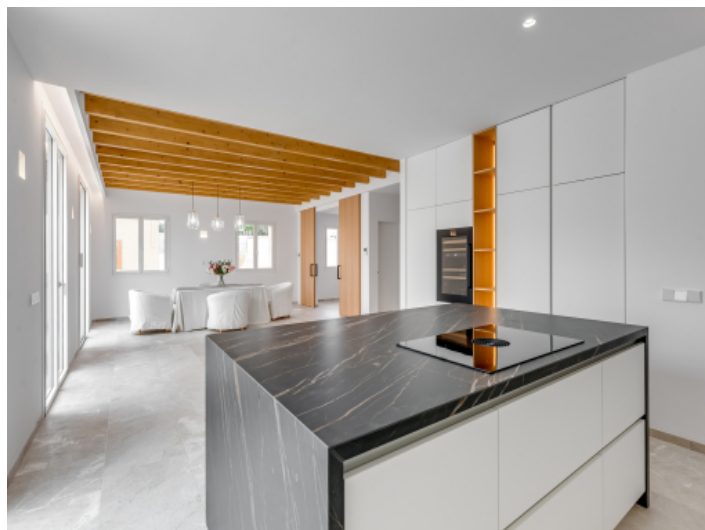
High quality kitchen