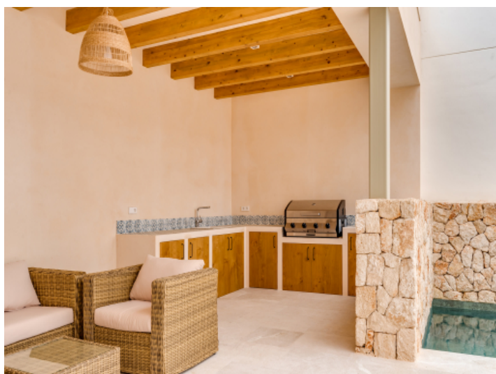
Outdoor kitchen and BBQ