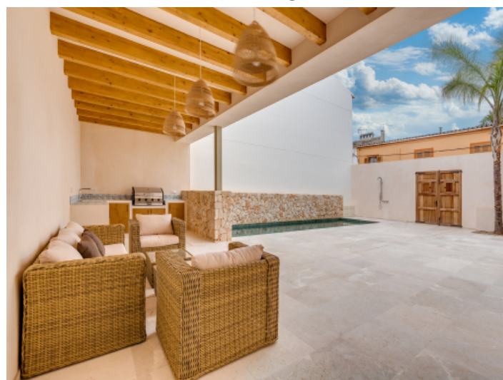
Beautiful patio with pool