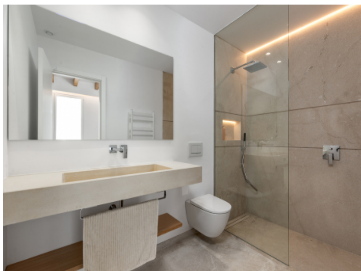
Bathroom en suite