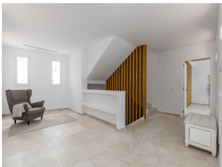
Hall on the first floor