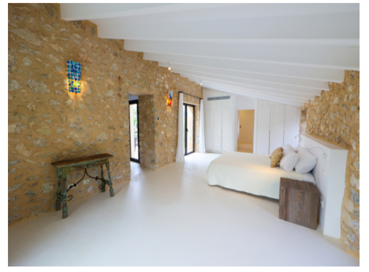
Natrual stone walls in one of the bedrooms