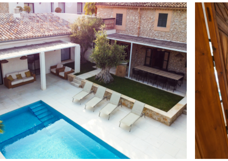
Beautiful pool and lots of privacy