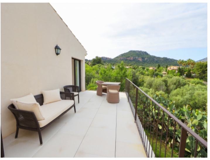
Terrace with great views