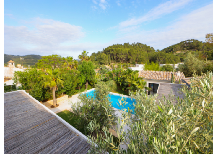
Views from the upper floor