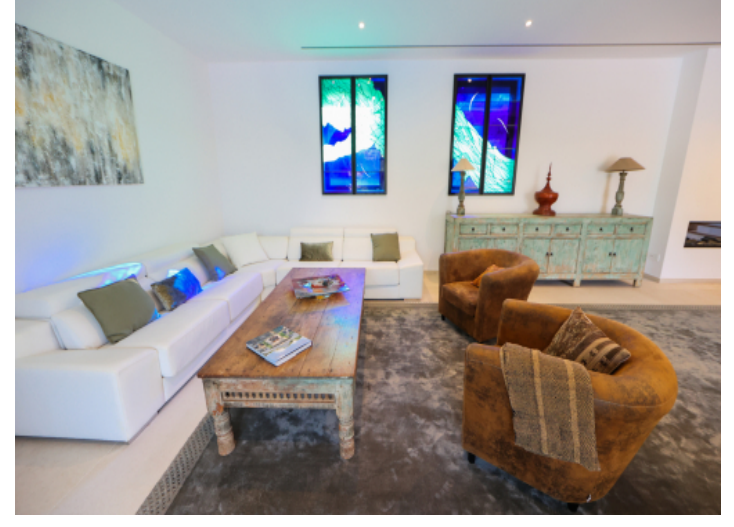
Modern living area