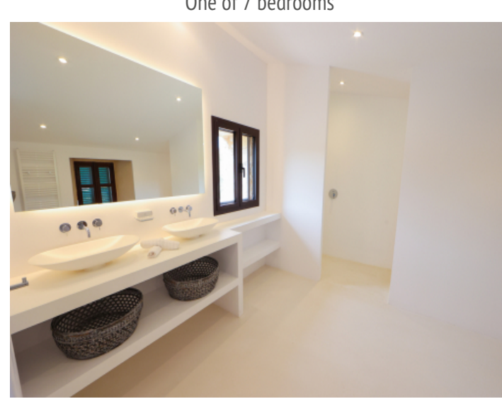
Modern countrystyle bathroom

PORTA MALLORQUINA • C./ COLOM 20 2º, 07001 PALMA, SPAIN TEL.: +34 971 698 242 • INFO@PORTAMALLORQUINA.COM • WWW.PORTAMALLORQUINA.COM