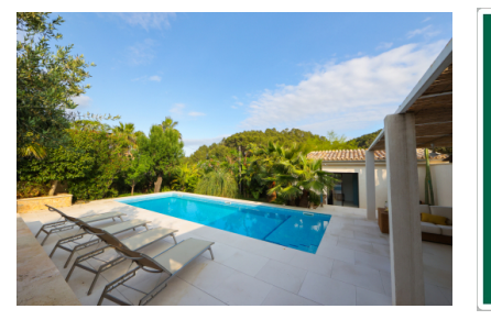
Capdella search for property MAL-121426