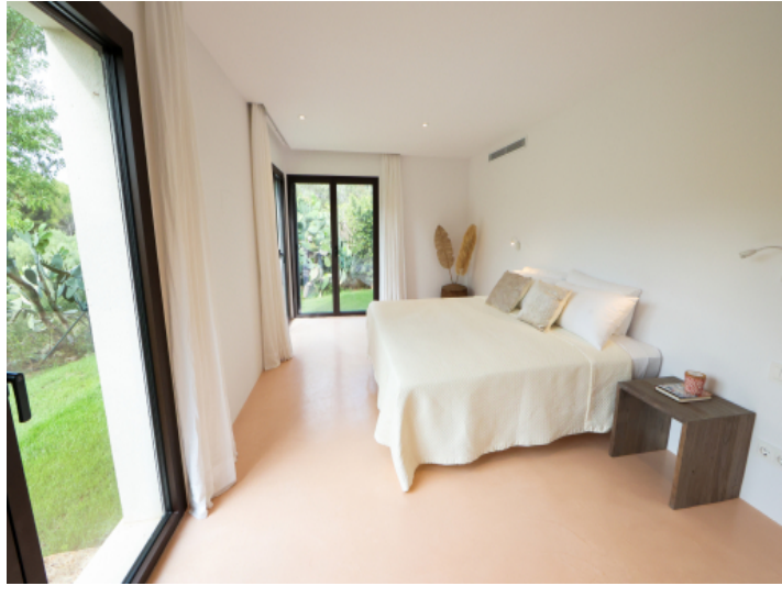
Bedroom with garden views

PORTA MALLORQUINA • C./ COLOM 20 2°, 07001 PALMA, SPAIN TEL.: +34 971 698 242 • INFO@PORTAMALLORQUINA.COM • WWW.PORTAMALLORQUINA.COM