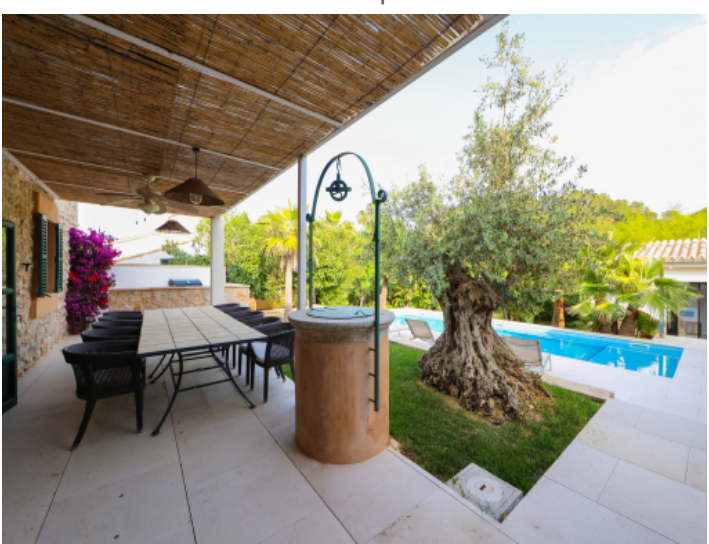
Dining area next to the pool