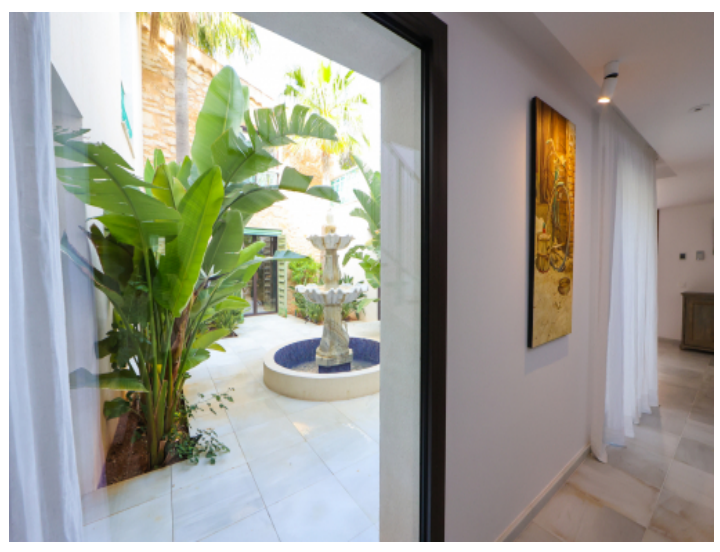
View to the patio