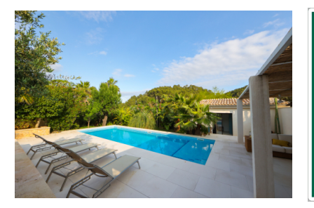
Capdella search for property MAL-121426