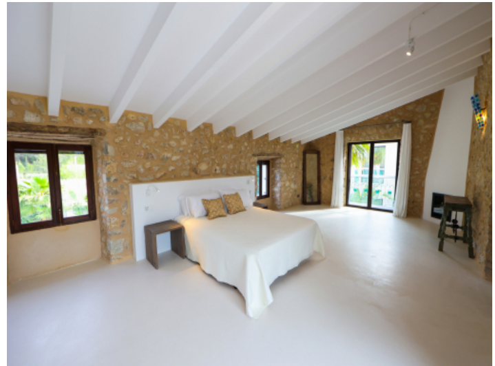
Cozy bedroom on the first floor