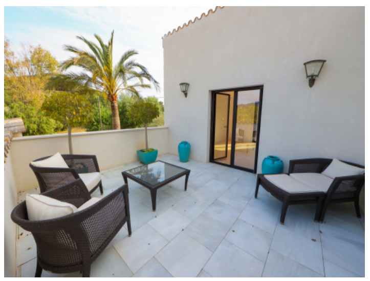
Private terrace of one of the bedrooms